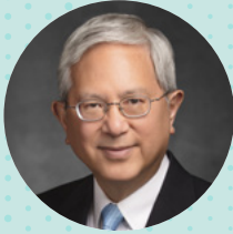
Mai vei Elder Gerrit W. Gong Ena Kuoramu ni iApositolo Le Tinikarua