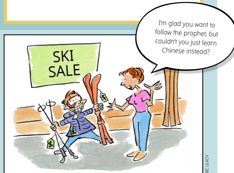
ILLUSTRATIONS BY DAVID KLUG