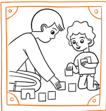
Stap wan gud eksampol mo helpem ol narawan.