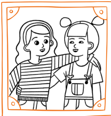
Helpem ol nara man oli filim welkam.

Kasem konfemesen: Afta we yu baptaes, yu kasem wan spesel prishud blesing blong kam wan memba blong Jos Ia blong Jisas Kraes mo kasem presen we i Tabu Spirit.