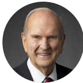
By President Russell M. Nelson