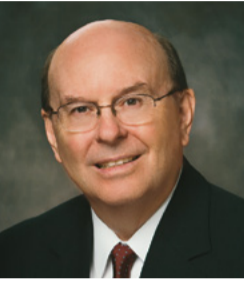
Quentin L. Cook