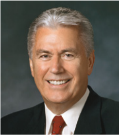
Dieter F. Uchtdorf