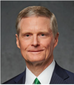
David A. Bednar