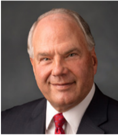
Ronald A. Rasband