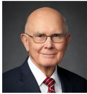
Dallin H. Oaks Tauturu hō'ē