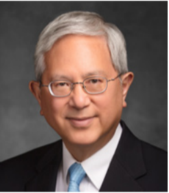
Gerrit W. Gong