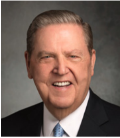
Jeffrey R. Holland