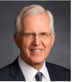
D. Todd Christofferson