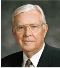
M. Russell Ballard