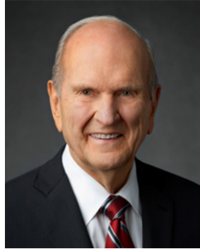
Russell M. Nelson Peresideni