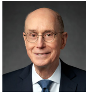
Henry B. Eyring Tauturu piti