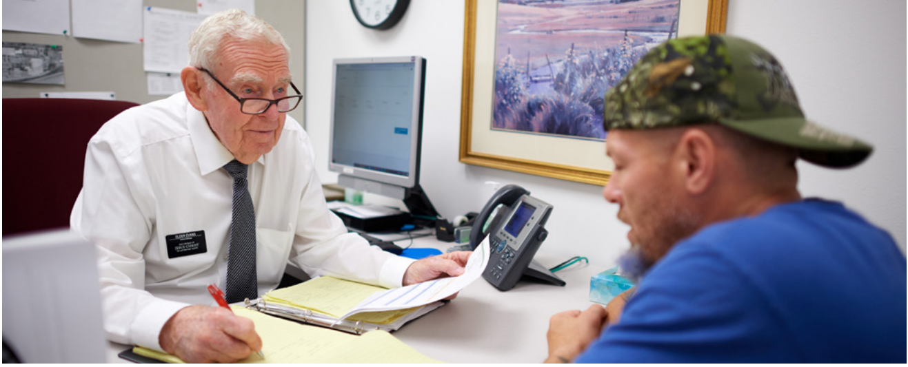
Above: The Church's Transitional Services works with those who require assistance with various needs, such as job search help and accessing local resources.