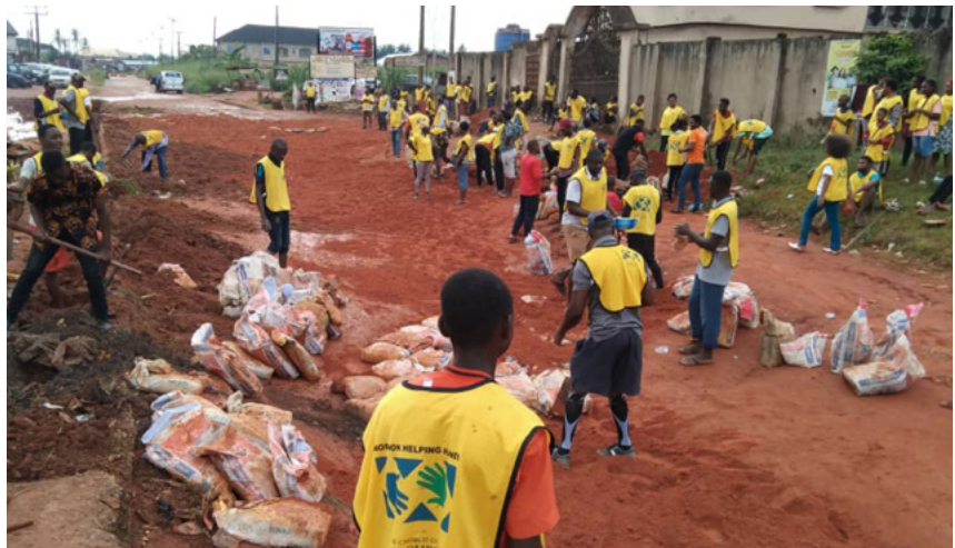
Above: Church members in Ghana organize to plant 15,000 seedlings for the 2021 All Africa Service Day.

IN BOLIVIA , the Relief Society sisters of the Los Andes Stake collected 34,000 plastic caps to support the Niño Feliz initiative, which helps low-income children with cancer receive chemotherapy treatments. And members of the Khovd branch in Mongolia visited their local Violence Victims’ Shelter to donate warm blankets, newborn supplies, and hygiene kits.