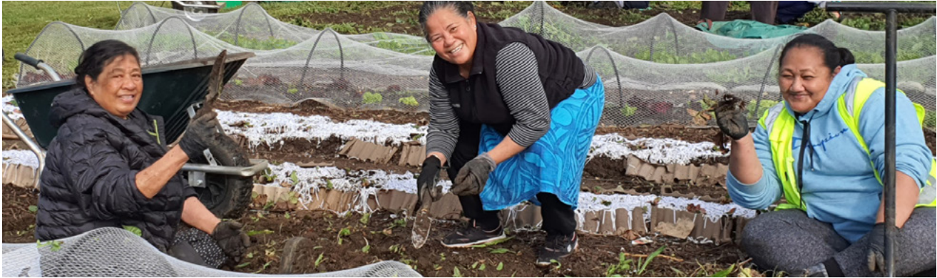
Above: Church members in Auckland, New Zealand, collaborate with other community organizations to weed gardens and beautify their community.

“Thou shalt love thy neighbour as thyself.”