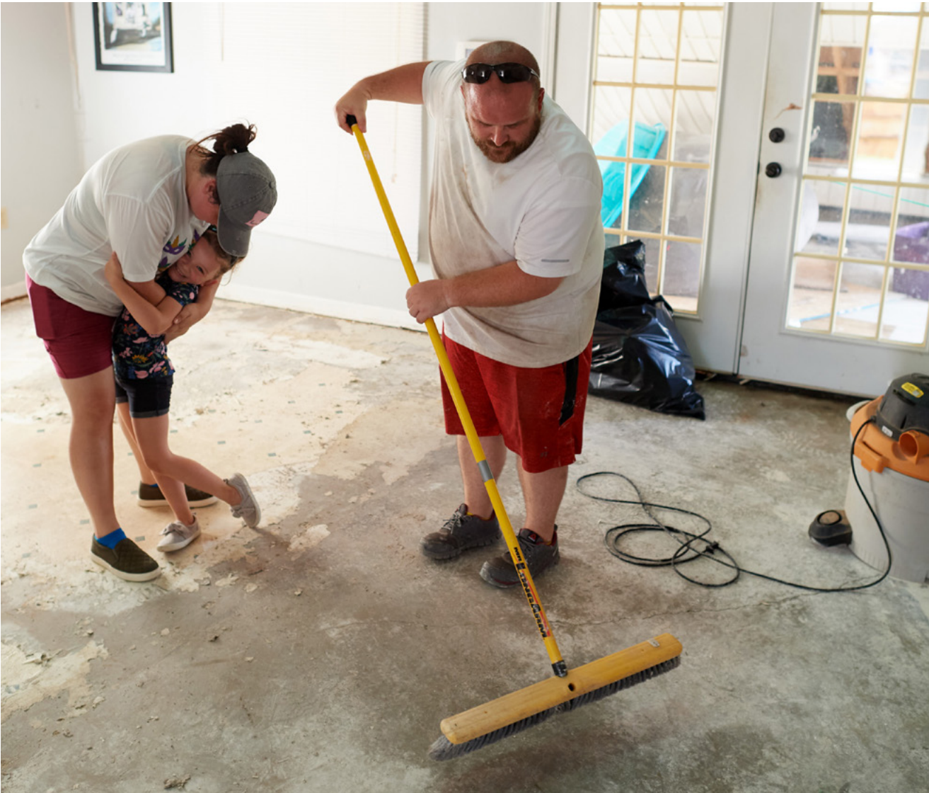
Above: Following Hurricane Ida, community volunteers, including members of The Church of Jesus Christ of Latter-day Saints, spent their Labor Day holiday weekend cleaning up.