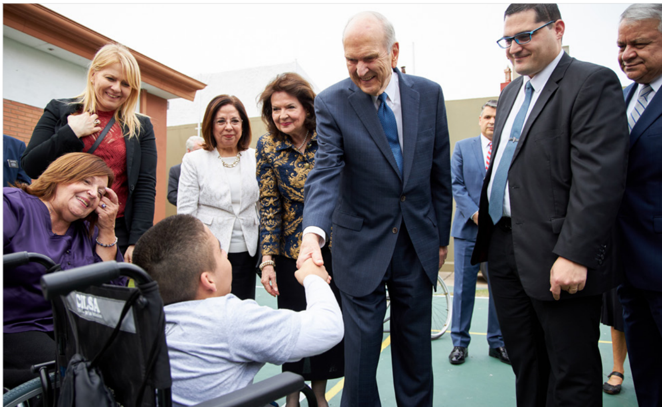
Above: During his Latin America ministry in 2019, President Russell M. Nelson attended a wheelchair distribution event in Argentina.