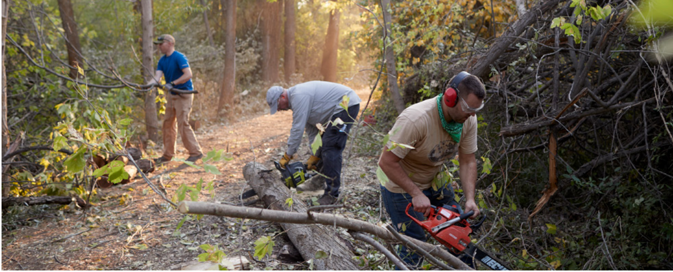
Above: Volunteers from a Church congregation in Kaysville, Utah, gather firewood from storm-impacted areas. The firewood was then delivered to residents of the Navajo Nation.