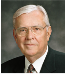
M. Russell Ballard