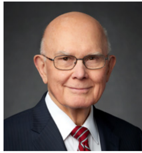
Dallin H. Oaks Matai ni Daunivakasala