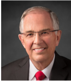
Neil L. Andersen