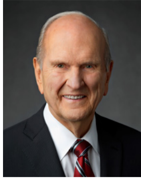
Russell M. Nelson Peresitidi