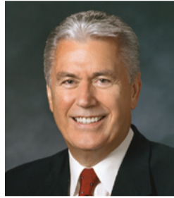
Dieter F. Uchtdorf