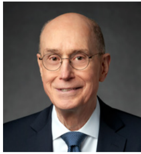
Henry B. Eyring Karua ni Daunivakasala