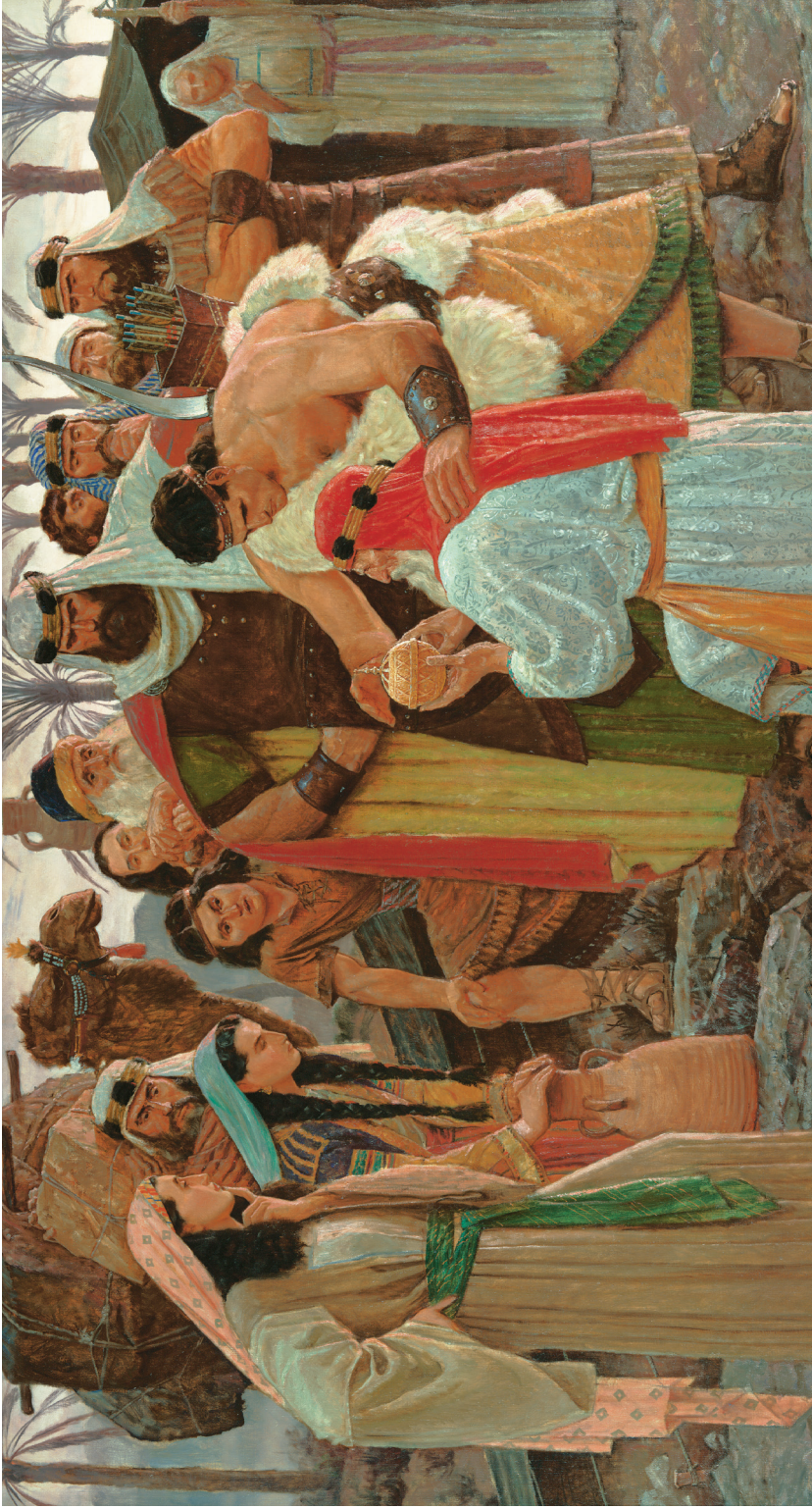
Lehi discovers the Liahona Painting by Arnold Friberg