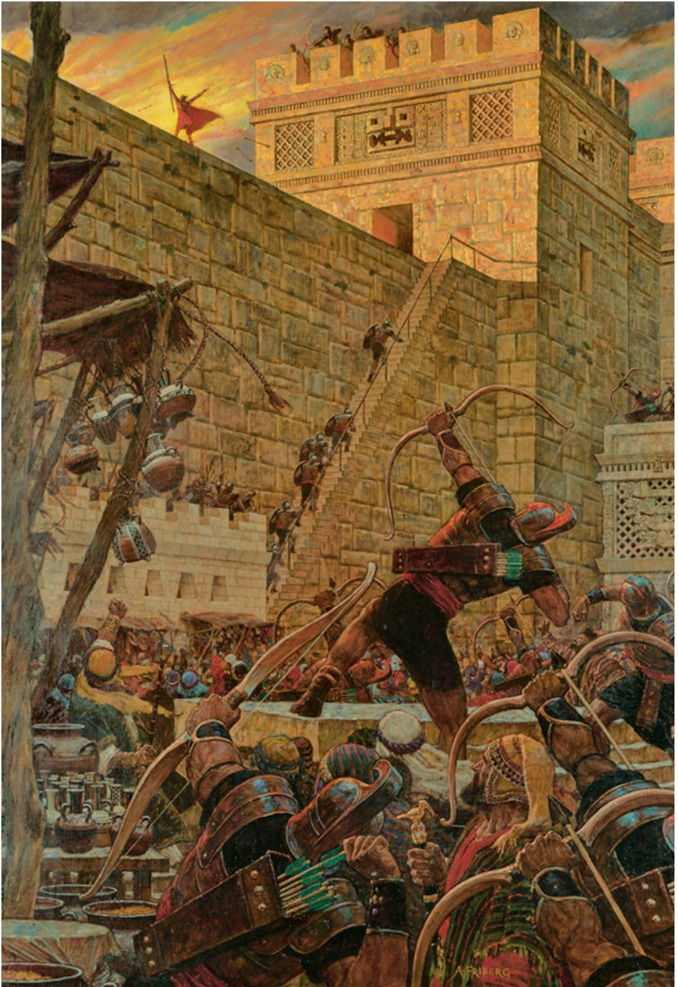
Samuel the Lamanite prophecies Painting by Arnold Friberg