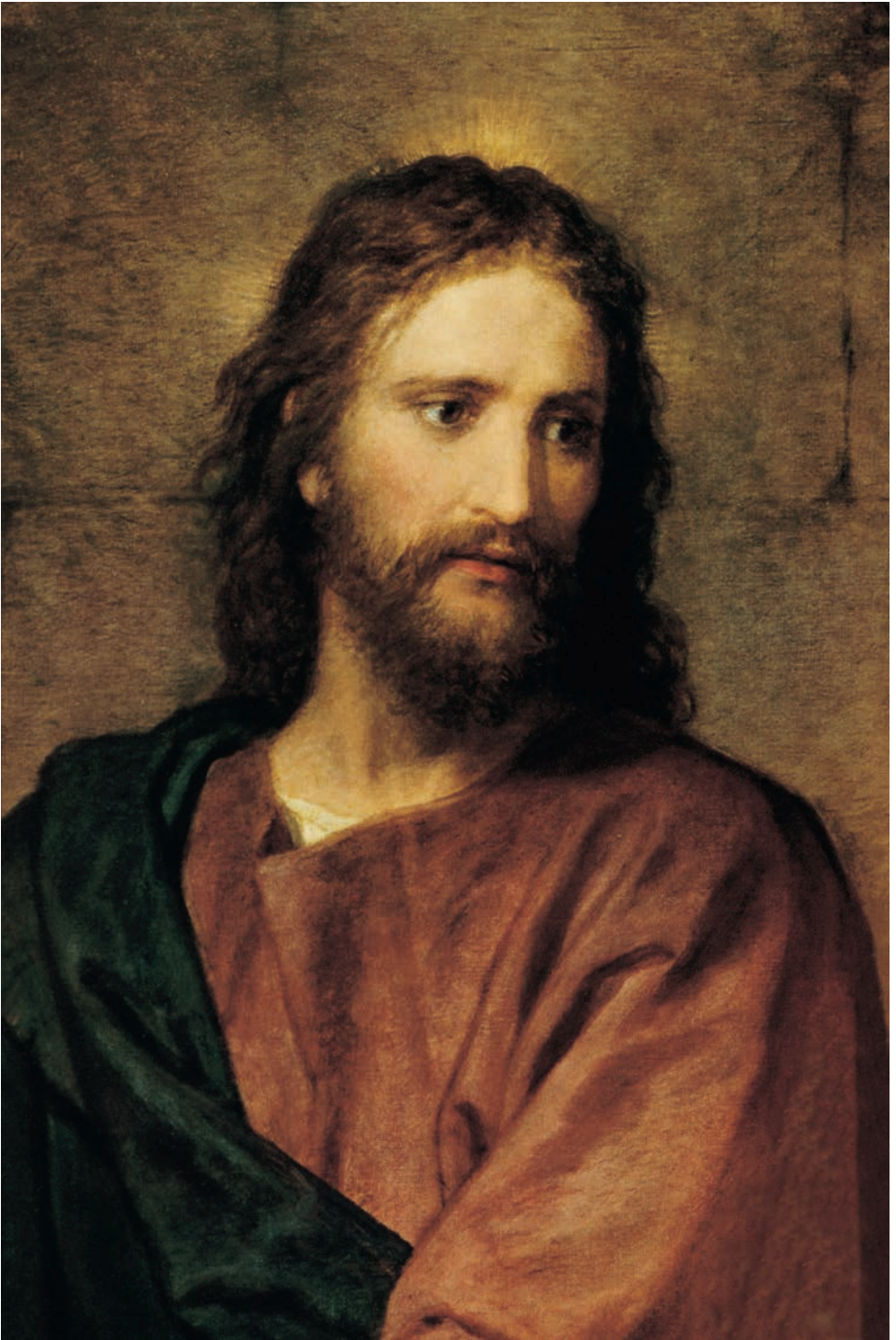
The Lord Jesus Christ Painting by Heinrich Hofmann