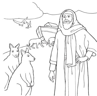
Noa (Jenesis 6-8)