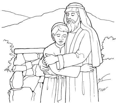
Ebrean (Jenesis 22:1-14)