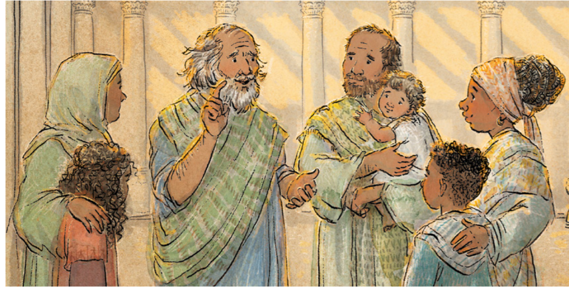
I Jakoba dia Apôstôly. Nampianatra ny hafa momba an’i Jesoa Kristy izy. Nanoratra taratasy iray ho an’ireo olona izay nino an’i Jesoa izy.