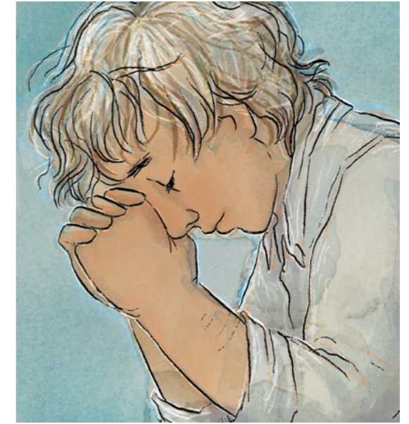
Nanontany an’ Andriamanitra izy hoe iza ilay Fiangonana tokony hidirany.