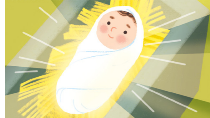
She wrapped Him in cloth to keep Him warm and safe.