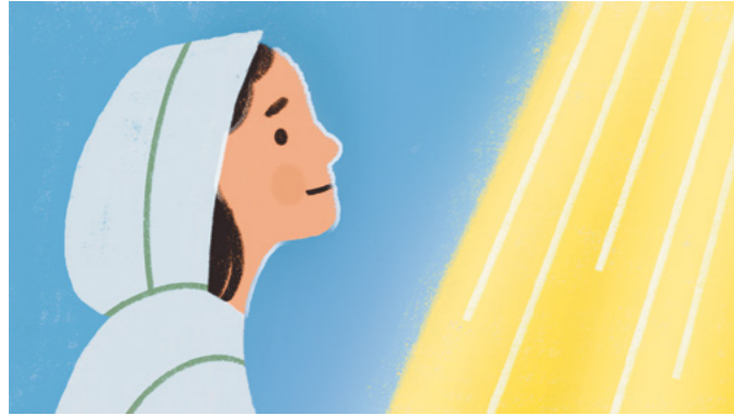
Long ago, an angel appeared to a young woman named Mary.