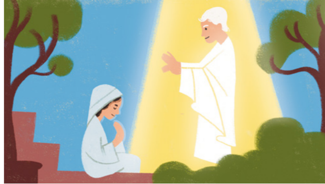
The angel told her that she would have a baby named Jesus and that He would be the Savior of the world.