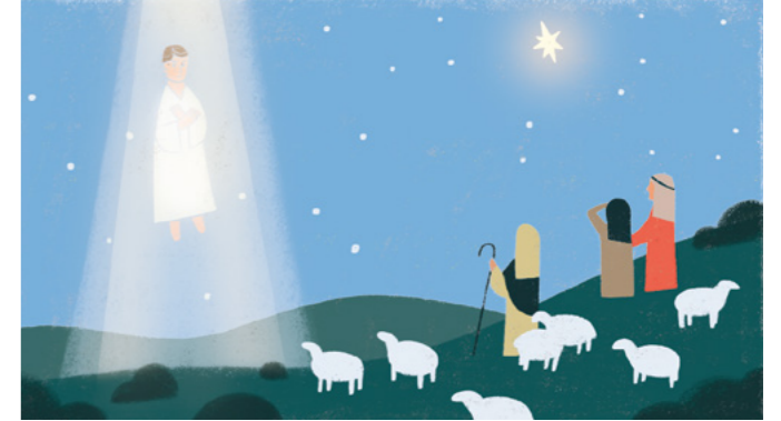
An angel visited shepherds and told them the joyful news. The Savior had come!