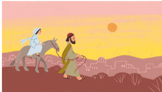
Before Mary gave birth, she and her husband, Joseph, traveled to Bethlehem.