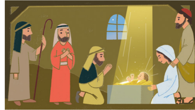
The shepherds hurried to the stable and found baby Jesus lying in a manger.