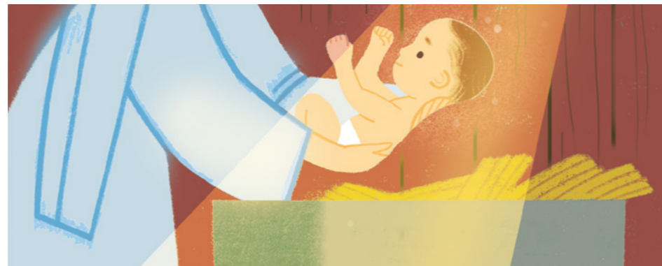
When Jesus was born, Mary laid Him in a manger.