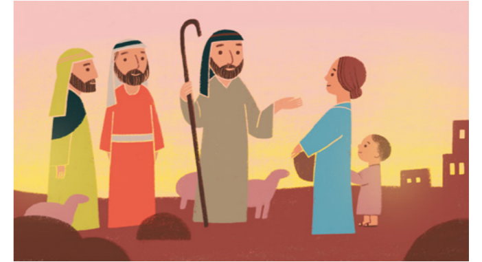
The shepherds were so happy! They went and told others that Jesus Christ had been born.