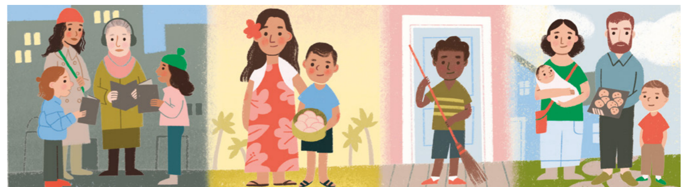
We can share the good news of Jesus's birth too—at Christmastime and always!