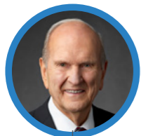
A. President Russell M. Nelson

"Parents, thank you for everything you're doing to raise your children. And children, thank you for everything you're doing to raise your parents."