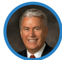
B. Elder Dieter F. Uchtdorf