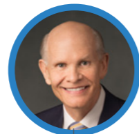
D. Elder Dale G. Renlund