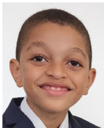
By Heber A., age 8, Praia, Cape Verde

I love reading the scriptures! When the new temple in Cape