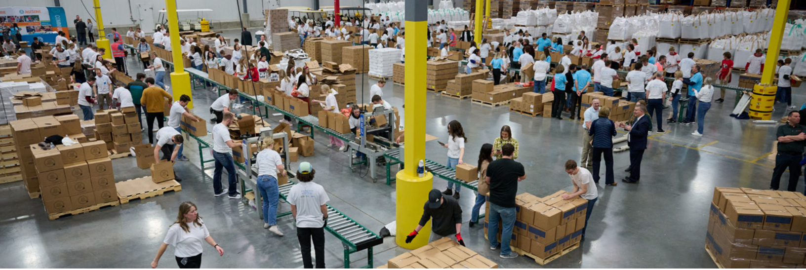
Young single adults in Utah assemble food boxes as part of an event marking the 10th anniversary of collaboration between the Church and the World Food Program.