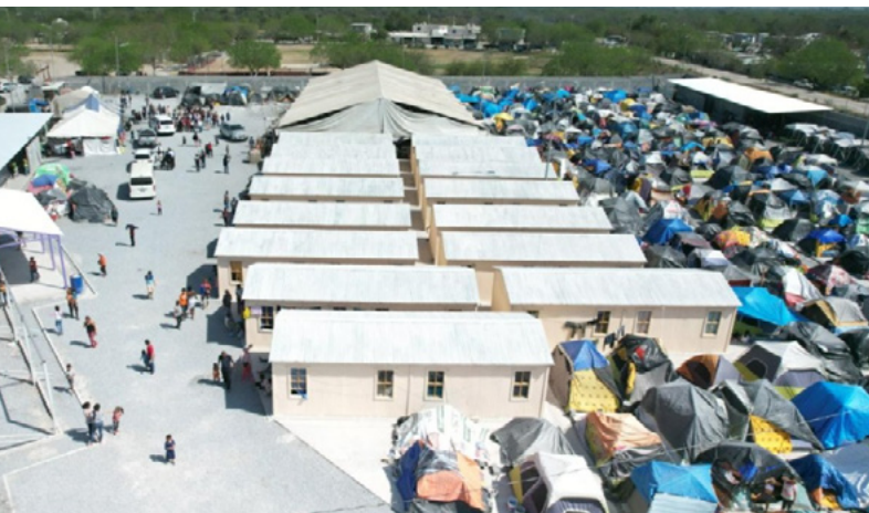
Displaced people living in donated temporary shelters in Mexico.

Following natural disasters, conflicts, or other challenges, many people often find themselves in need of shelter. The Church supports housing efforts worldwide to help people recover from these difficult situations, and it collaborates with trusted organizations to transition individuals to more permanent housing solutions or to build and furnish new homes or businesses.