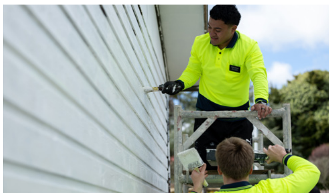
Young adults and missionaries in New Zealand volunteer to help restore homes.

The Church's humanitarian efforts in the Pacific are often tied to the many natural disasters that affect the area, including volcanoes, cyclones, and flooding. The Church also collaborates with like-minded organizations in the Pacific to address other regional needs such as improving child nutrition and providing greater access to clean water.