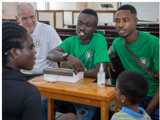
Top to bottom: Relief Society sisters in Tonga prepare meals for those in need in their ward. Church members volunteer to help at a child nutrition screening in Ghana.