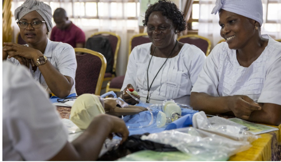
Left: A woman in Liberia pours clean water from the village well. Right: Midwives participate in the Helping Babies Breathe training organized by Project HOPE with the Church in Sierra Leone.

The Church also supported educational initiatives by contributing to a UNICEF project focused on early childhood education. This effort provided 6,000 out-of-school children with alternative learning programs or catch-up classes and gave 140,000 children access to quality education programs.