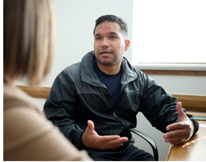
Left: An operations supervisor trains Deseret Industries associates on the sales floor. Right: A man receives job search help at an Employment Center.