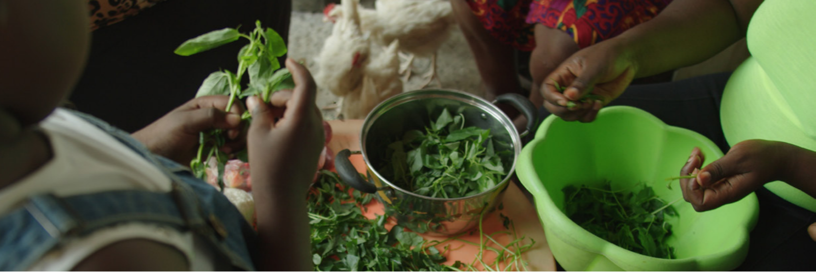
Children in Ghana helping to make dinner.