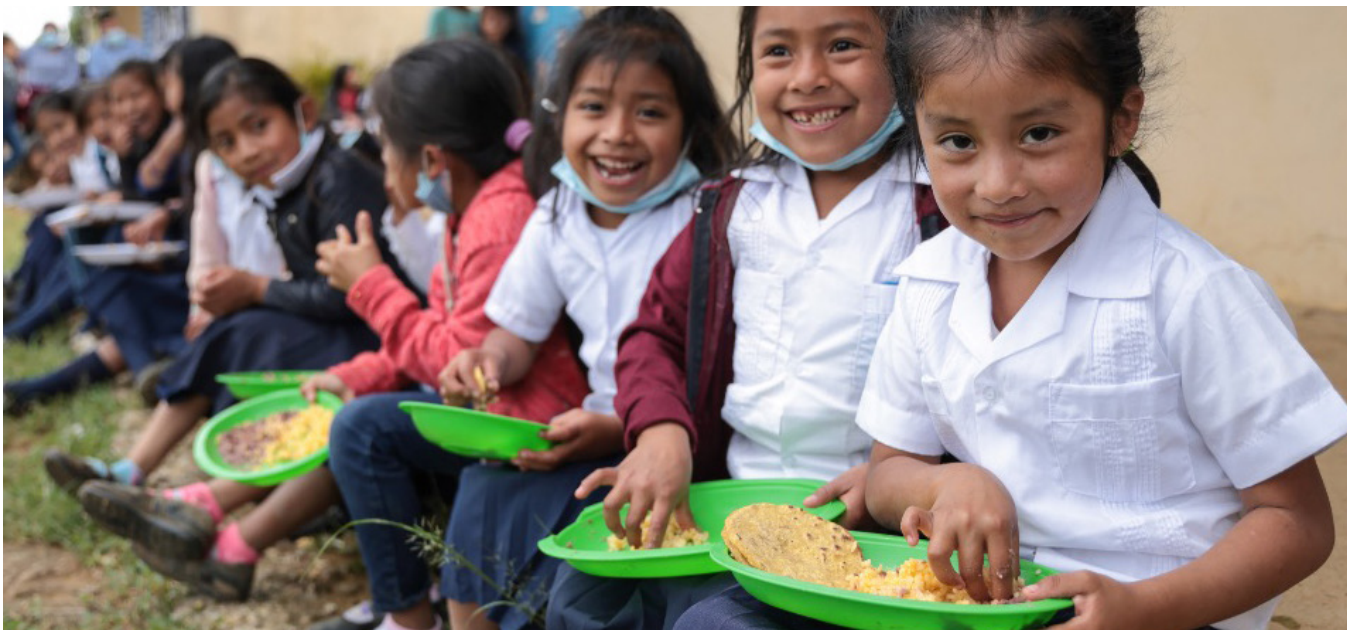
Students in Honduras eat a meal during recess.

—GERRIT W. GONG, THE QUORUM OF THE TWELVE APOSTLES 17