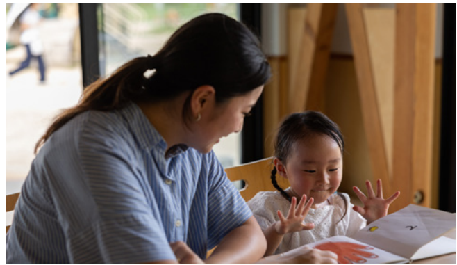
A girl in Japan learns how to count.

The Church also supports educational needs worldwide by funding refurbishments and teacher training and providing equipment such as desks,