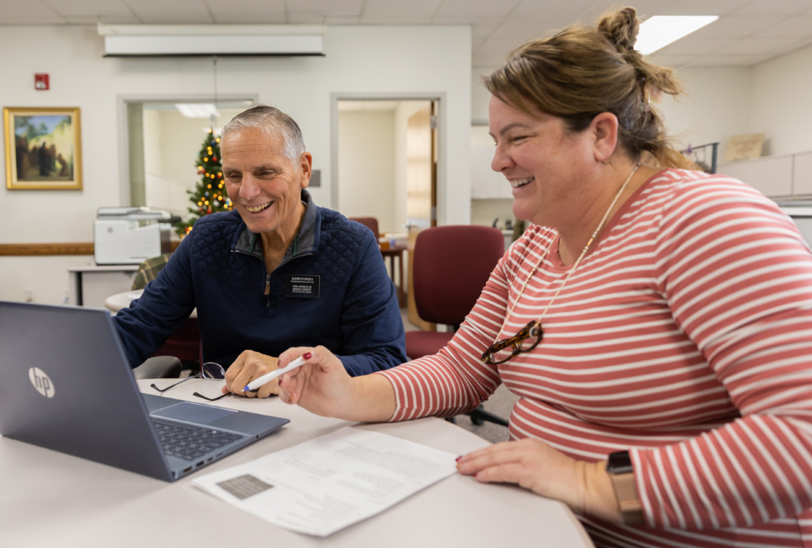
An employment services missionary helps a woman with her job search in an Employment Center.