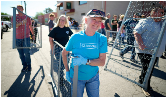
Clockwise from top: Youth in California participate in Global Youth Service Day by creating containers that will be filled with toys and comforting items for children in hospitals. Volunteers registering for JustServe at the National Book Fair in Argentina. Members of the Church assemble new beds for the Las Vegas Rescue Mission. A group of volunteers clean up trash around a river in Utah.