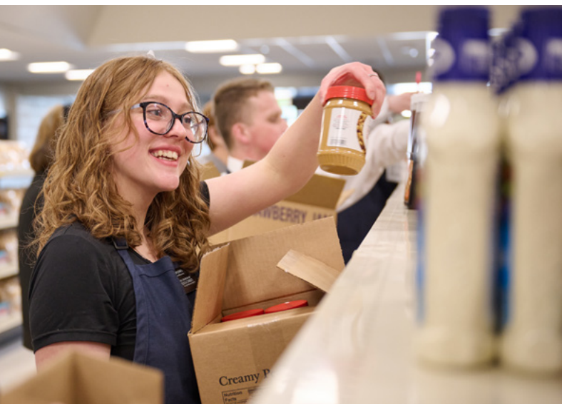
A sister missionary restocks shelves at a bishops' storehouse.

While many Church members engage in community service, some dedicate additional time and talents to humanitarian work by serving as missionaries.