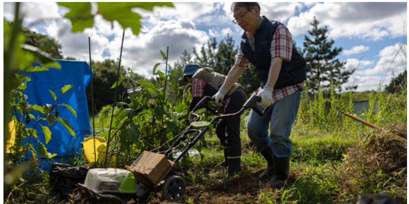
A couple in Japan takes care of a garden for their community.

“[These] figures are, of course, an incomplete report of our giving and helping. They do not include the personal services our members give individually as they minister to one another in called positions and voluntary member-to-member service. And our [summary] makes no mention of what our members do individually through innumerable charitable organizations not formally connected with our Church.”