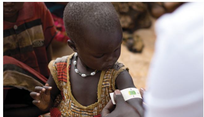
A UNICEF worker uses a MUAC tape to detect malnutrition in children in drought-stricken areas of northeastern Uganda.