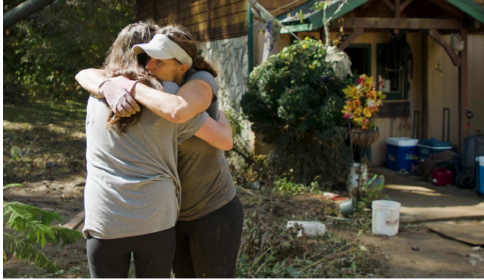
Left: A woman in Syria cooks a meal outside her temporary shelter. Right: Two women embrace following the destruction of Hurricane Helene.

Church donated food and hygiene kits and hot meals to Asociatia La Rasruce, which the organization distributed to Ukrainians in need, even implementing a system to deliver the hot meals to homebound older adults.