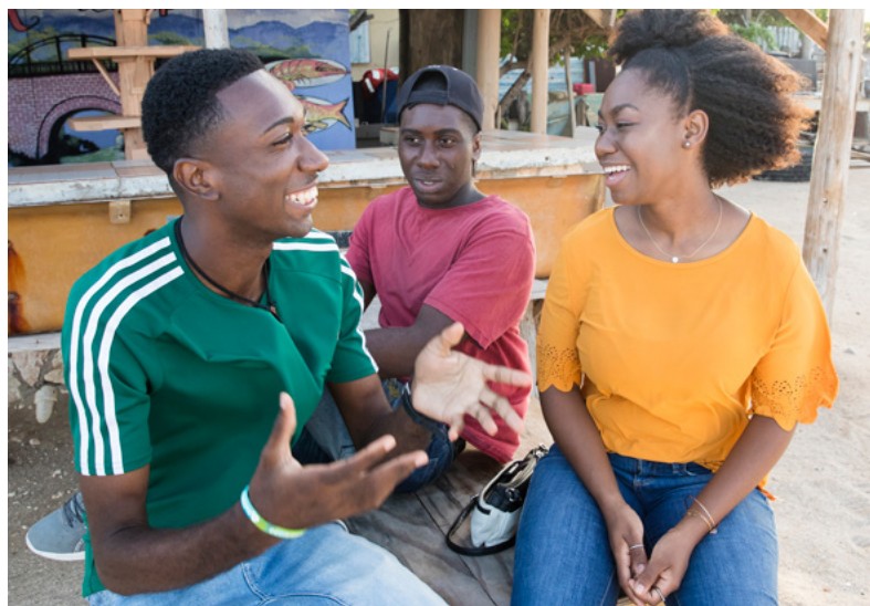
Young adults in Jamaica plan a service project together.

After Hurricane Beryl devastated many areas, members of the Church from surrounding locations volunteered and traveled to Union Island to deliver much-needed supplies, such as food and hygiene kits. Members also served alongside other organizations to clear roads of debris from the hurricane.