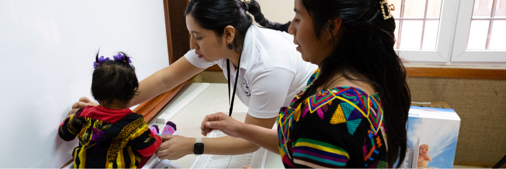
A doctor weighs a child as part of the Member-focused Child Nutrition Effort.