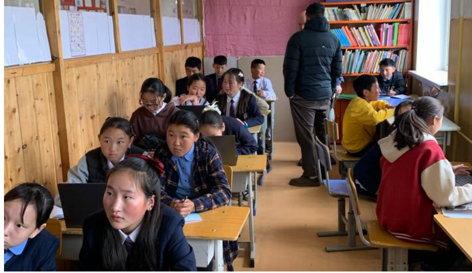
Left: Missionaries in South Korea help an individual move into a new apartment. Right: Children in Mongolia use donated computers at school.

In April, the Mount Ruang Volcano erupted in Indonesia. In response, the Church collaborated with the local government and other organizations to provide shelter, clothing, and other necessities for around 3,600 displaced individuals.