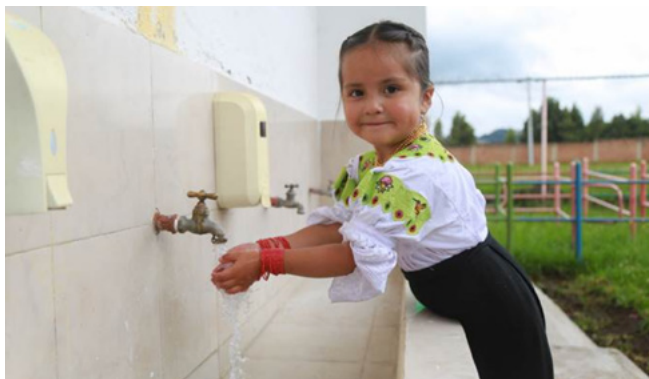
A girl washes her hands with clean water in Ecuador.

In 2024, the Church supported UNICEF's efforts to implement WASH programming in more than a dozen countries across South America, Africa, and the Pacific. In Uganda, the Church supported WaterAid's efforts to provide safe drinking water and sanitation facilities to communities in need. They successfully installed eight piped water systems, also known as boreholes, benefiting more than 2,500 people. Along with the new water systems, they implemented hygiene and sanitation instructions at each new tap