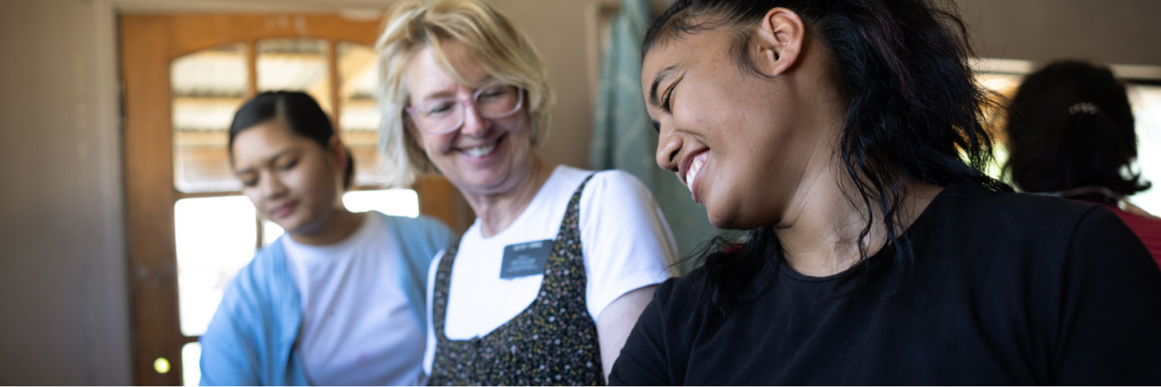
Relief Society sisters in Tonga cook a meal for those in need in their community.