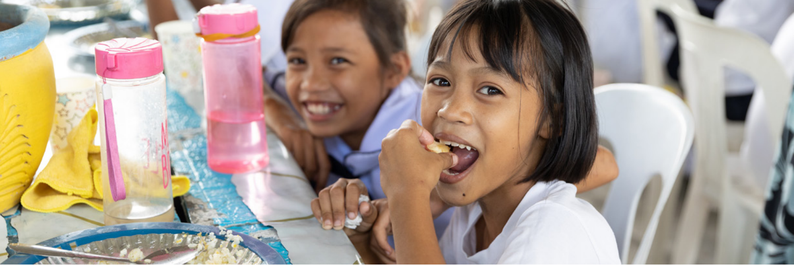
Children in the Philippines receive a nutritious meal at a school founded by the Rise and Rebuild Foundation.