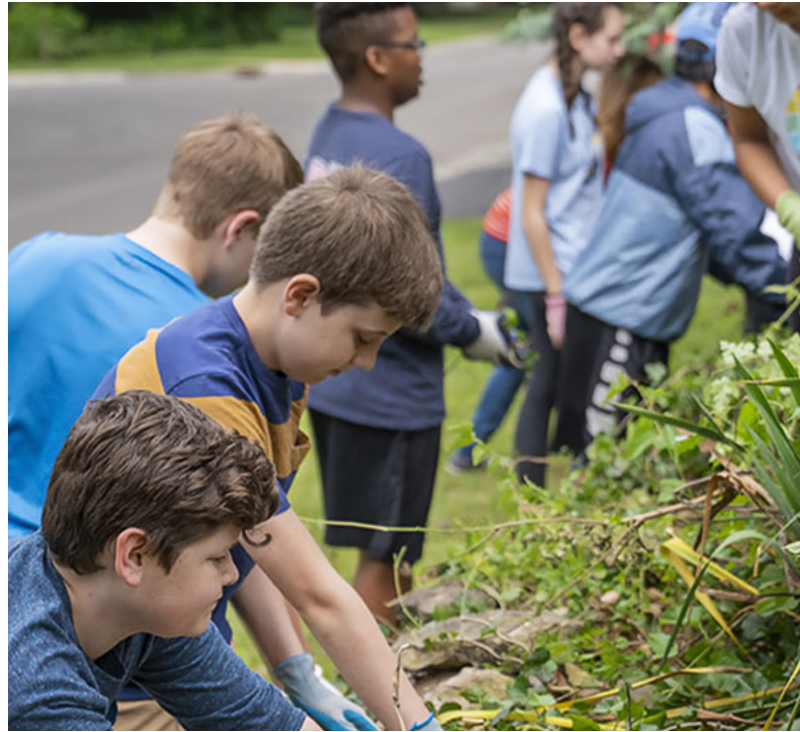
Youth in Ohio participate in a community service project.