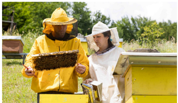
Clockwise from top: Farmers watering their community garden in Liberia. A woman in Tonga sells goods out of her shop. A collaboration with Muslim Aid provides individuals in Bosnia with beehives and education on beekeeping. Relief Society sisters teach others in their community how to read and write.