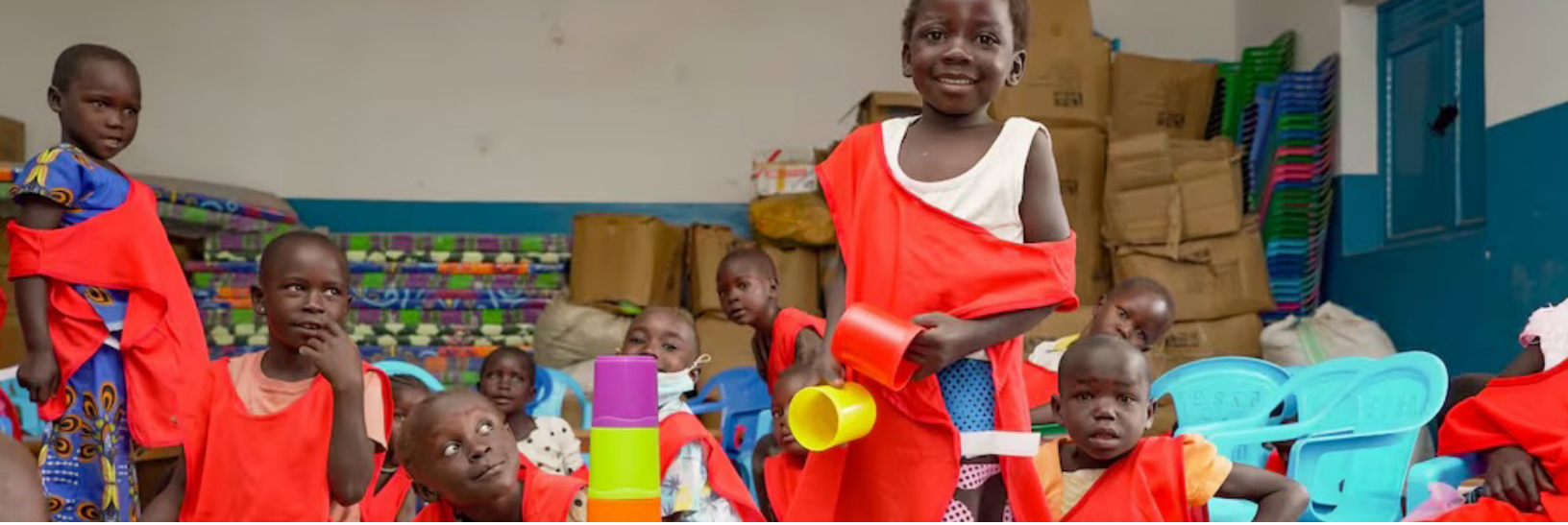
Students in the Democratic Republic of Congo play at a UNICEF-supported mentoring and development center.