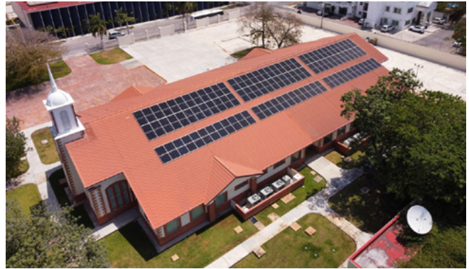
A meetinghouse of the Church in Peten-Playa del Carmen, Mexico, uses solar panels to harness the power of the sun.

At the Church's flagship printing center, all excess paper scraps—from manufacturing scriptures to lesson manuals—are carefully bundled and returned to paper suppliers to be turned into new pulp.