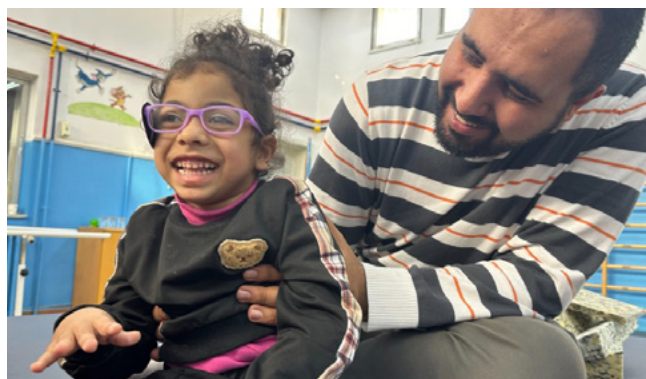
Children are fitted for new specialized wheelchairs at the Al Hussein Society.

Many thousands have been forced to flee their homes and find refuge elsewhere, with women and children being particularly affected in Yemen, Syria, and Lebanon. The Church seeks to alleviate the suffering of displaced persons by donating to relief programs and assisting initiatives that empower these individuals.