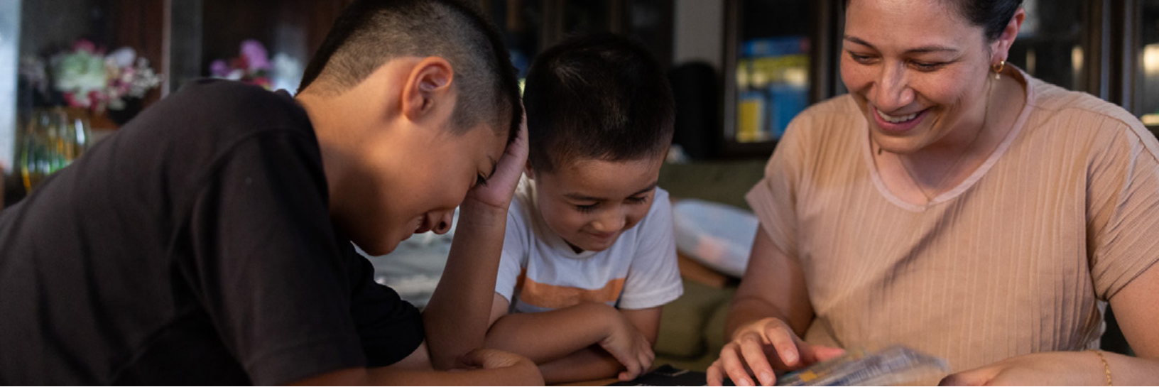
A woman in Japan reads to her children.