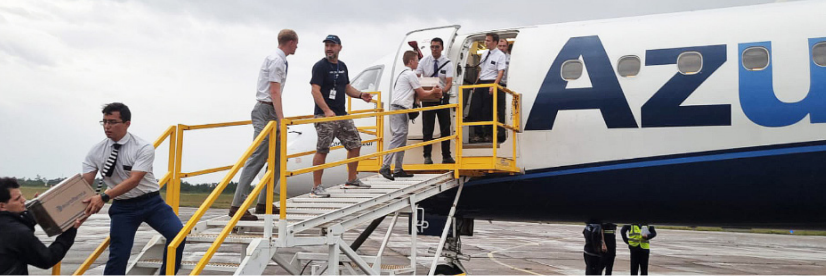
Missionaries help unload emergency supplies from an airplane following severe flooding in Rio Grande do Sul, Brazil.