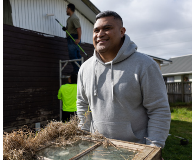
Left: Volunteers package meals for Hunger Fight at the 2024 BYU Women's Conference. Right: A member of the Church in New Zealand participates in a neighborhood service project.