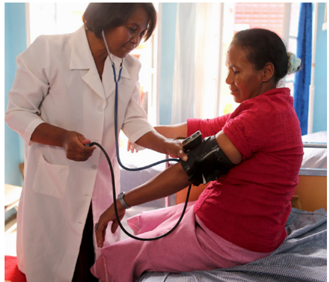
Left: Child in Sierra Leone receives a vaccination. Right: Woman in Madagascar meets with a doctor for a health examination.