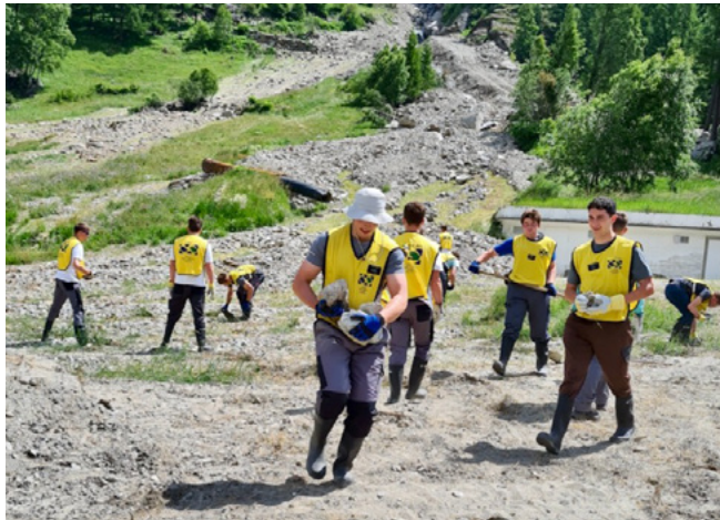
Missionaries in Switzerland assist with cleanup efforts after severe storms.

Natural disasters and political conflict were among the many challenges Europe faced in 2024. In response, the Church funded and collaborated on numerous humanitarian projects in the region, focusing on disaster relief, vulnerable populations, and food security.