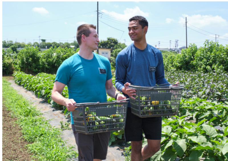
Missionaries in Japan serve on a local farm.