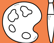
watercolor paint and paintbrush