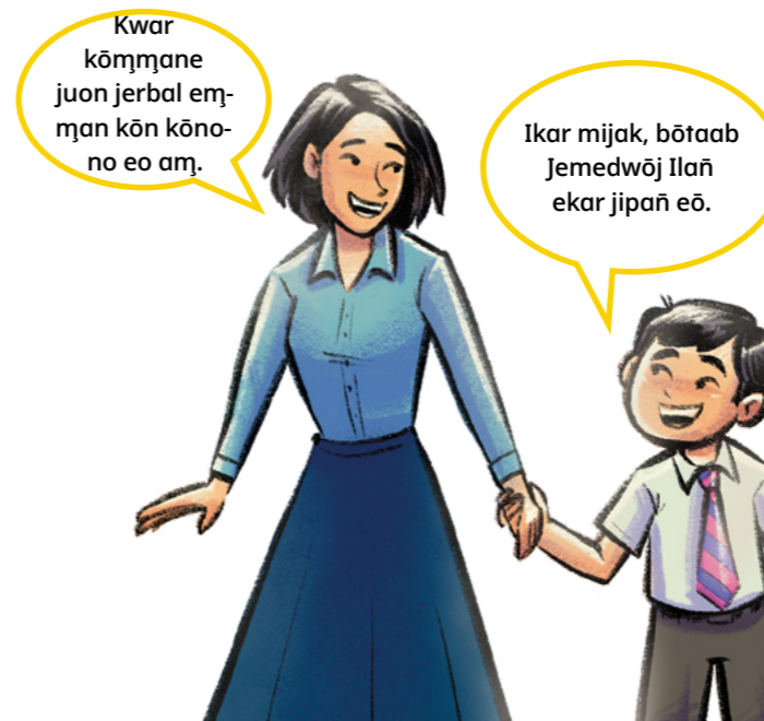
Bwebwenato in ekar bōk jikin ilo Hong Kong.

KWAĻOK JUON KŌNONO Ñe kwoj kwaļok juon kōnono, kwomaroñ kwaļok juon eoon ak ba juon bwebwenato kōn Jisōs. Juon pāaren ak ritōl emaroñ jipañ eok.