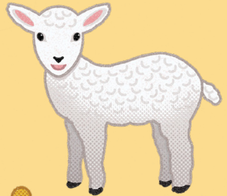
B. Lamb of God