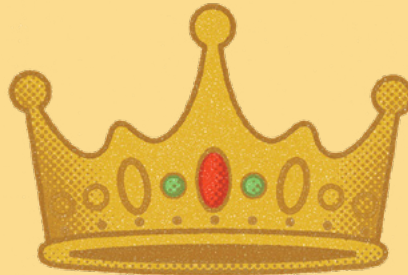
C. King of Kings