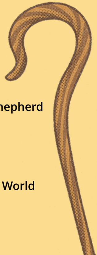
E. Good Shepherd