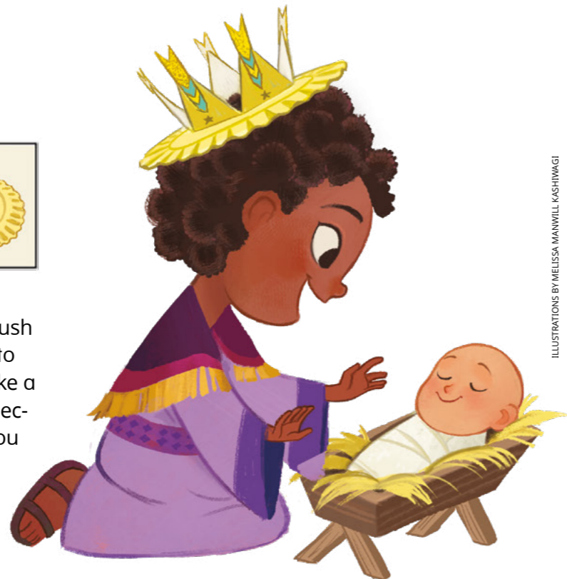
ILLUSTRATIONS BY MELISSA MANWILL KASHIWAGI