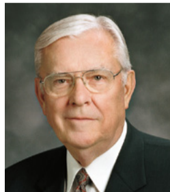
M. Russell Ballard