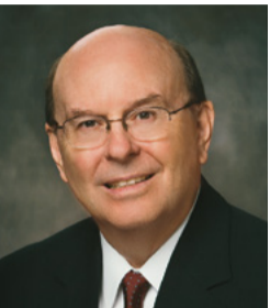
Quentin L. Cook