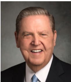
Jeffrey R. Holland