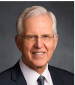
D. Todd Christofferson