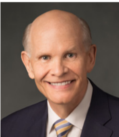
Dale G. Renlund