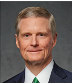
David A. Bednar