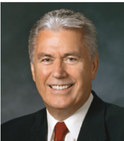
Dieter F. Uchtdorf