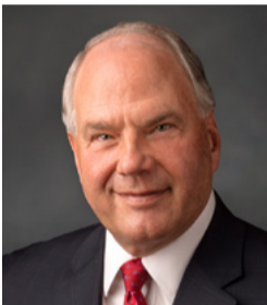
Ronald A. Rasband