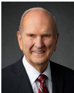
Russell M. Nelson Beretitenti