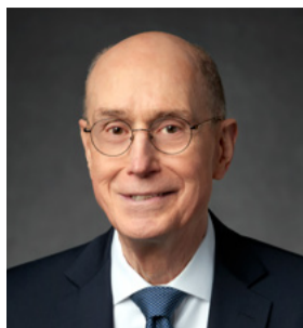
Henry B. Eyring Kauoman ni Kauntira