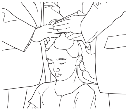
... Me Whakamanahia