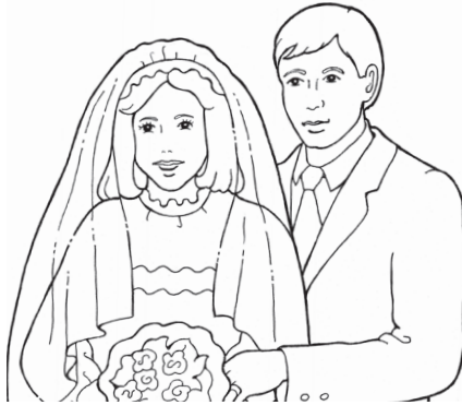
... Hīria tahi ā-whānau