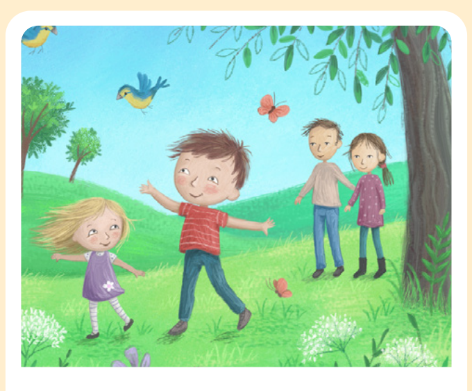
There is so much to be grateful for!