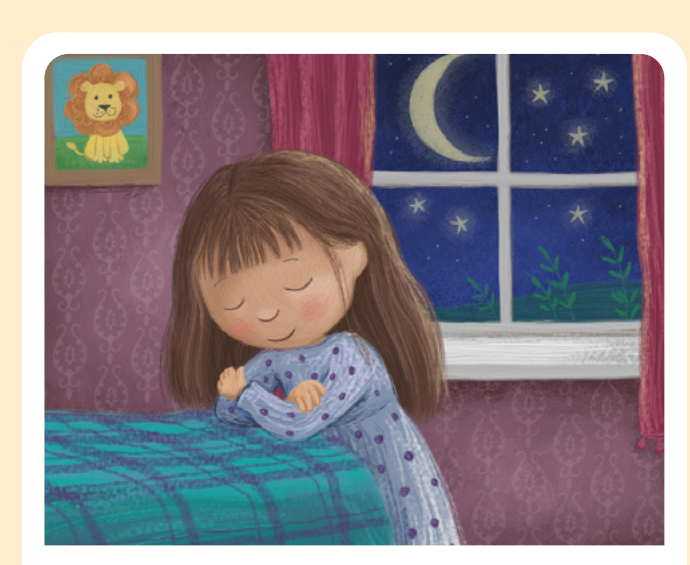
I can thank Heavenly Father for His love.