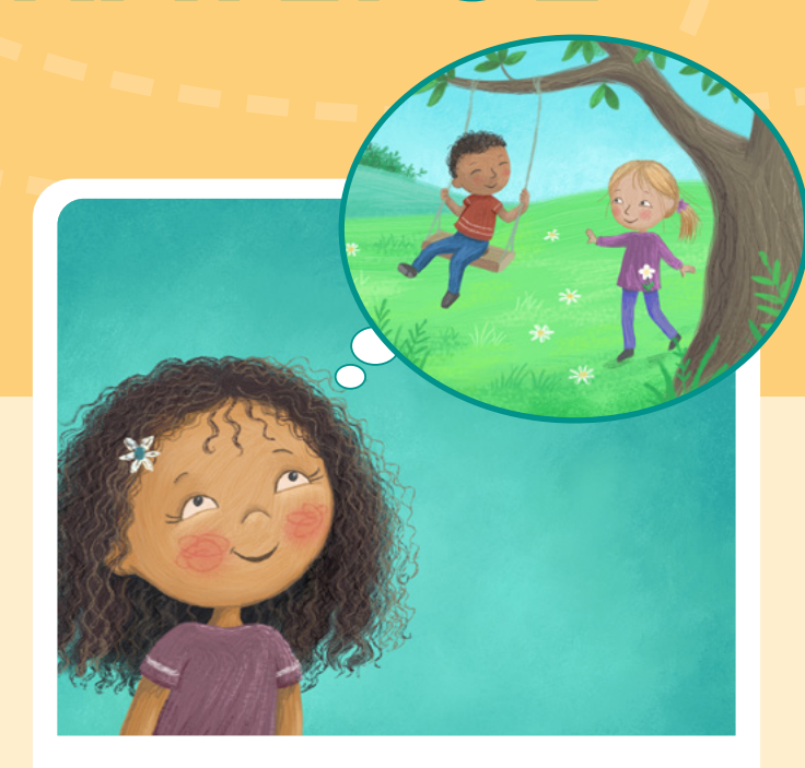
I can think about good things in my life.