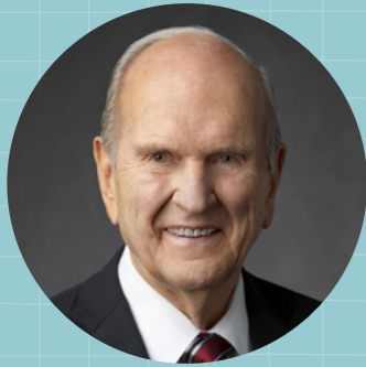
I Kam long Presiden Russell M. Nelson