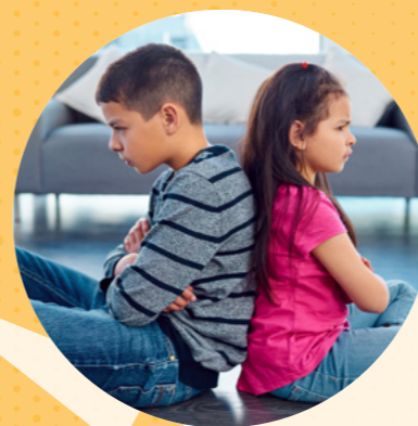
KAM LONG JISAS, I KAM LONG MICHAEL MALIM