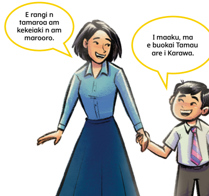
E riki te karaki aei i Hong Kong.

ANGA TE MAROORO Ngkana ko anga am taetae, ko kona n tibwaua te kibu ke ni karakina rongorongon Iesu. E kona n buokiko am karo ke am tia kaiiri.