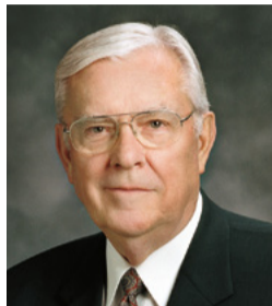
M. Russell Ballard