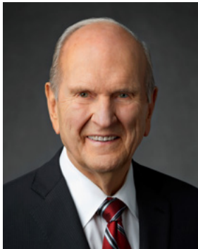
Russell M. Nelson Peresitene