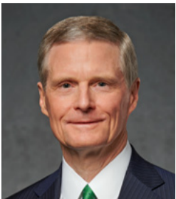
David A. Bednar