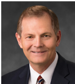
Gary E. Stevenson