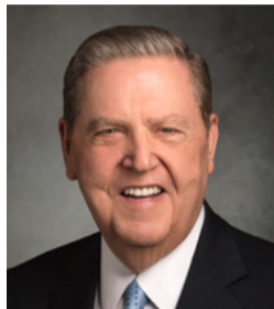
Jeffrey R. Holland