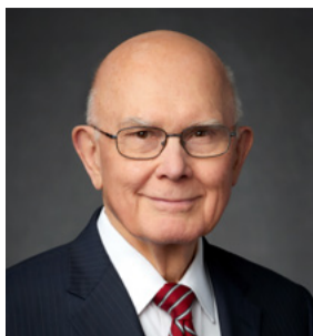
Dallin H. Oaks Fesoasoani Muamua