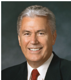
Dieter F. Uchtdorf