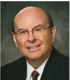
Quentin L. Cook