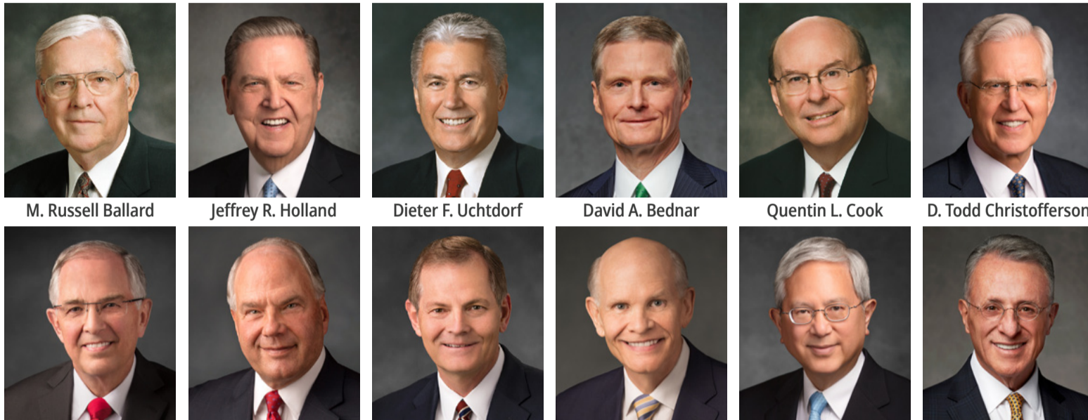
M. Russell Ballard Jeffrey R. Holland Dieter F. Uchtdorf David A. Bednar Quentin L. Cook D. Todd Christofferson Neil L. Andersen Ronald A. Rasband Gary E. Stevenson Dale G. Renlund Gerrit W. Gong Ulisses Soares