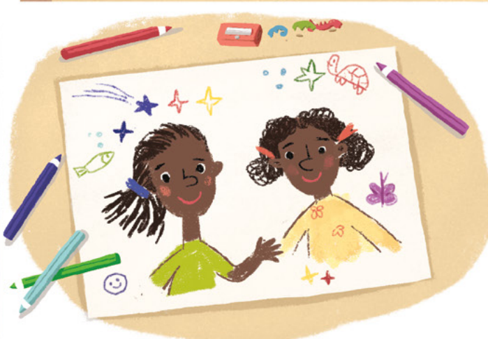
This story happened in Madagascar.

"The Savior's Atonement is not just for those who need to repent; it is also for those who need to forgive."