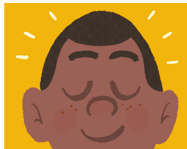
Jisas i givim sakramen long yumi from Hem i lavem yumi.