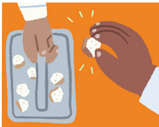
Taem mi go long jos, mi save tekem sakramen.