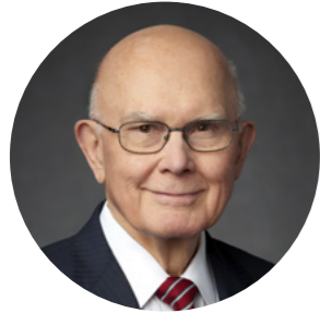
By President Dallin H. Oaks First Counselor in the First Presidency