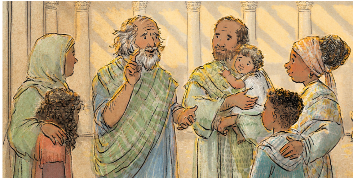
Jemes i wan Aposol. Hem i tijim ol narafala man abaot Jisas Kraes. Hem i raetem wan leta long ol pipol we oli biliv long Jisas.