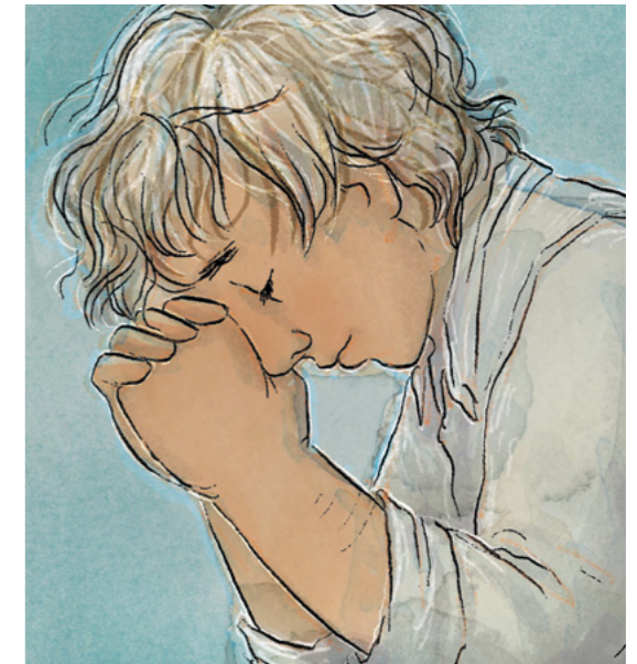
Hem i askem long God wijwan jos blong hem i joenem.