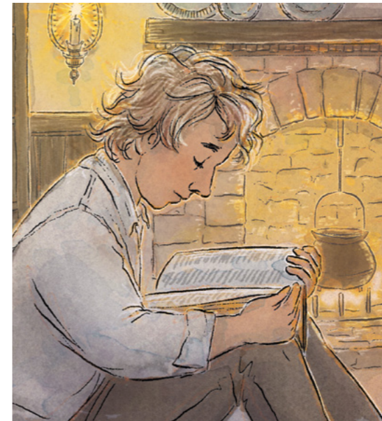
Plante ya i pas, Josef Smit i bin ridim leta blong Jemes insaed long Baebol.