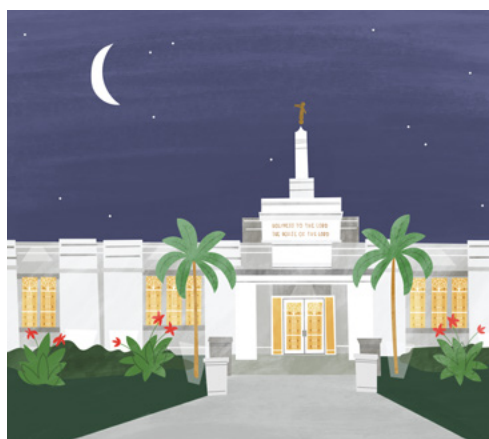
Aba Nigeria Temple