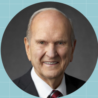
Jān Būreejtōn Russell M. Nelson