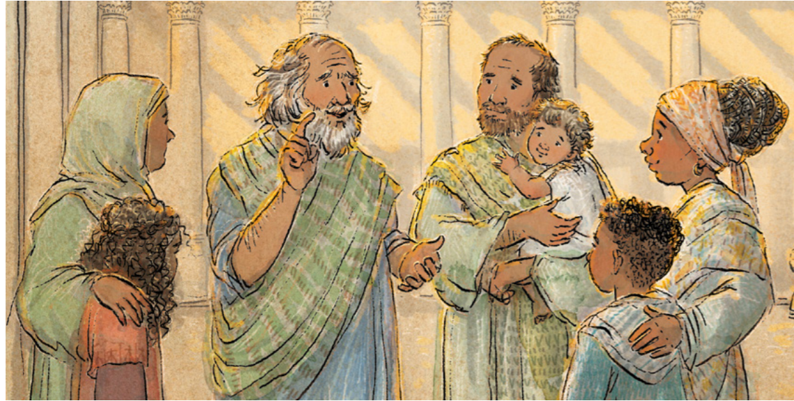
Iakobo bon te Abotoro. E reireinia aomata taekan Iesu Kristo. E korea te reta nakoia aomata ake a kakoaua iroun Iesu.