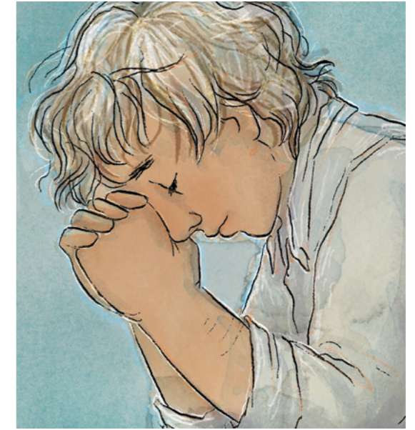
E bubutia te Atua bwa e nga te Ekaretia ae na kaaina.