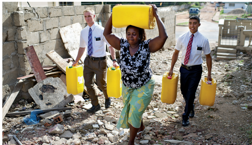
Above: Two missionaries serve the people of Ghana, West Africa.

Missionaries drove up to six hours from Canada to a small town in Minnesota in the United States to coordinate relief efforts following