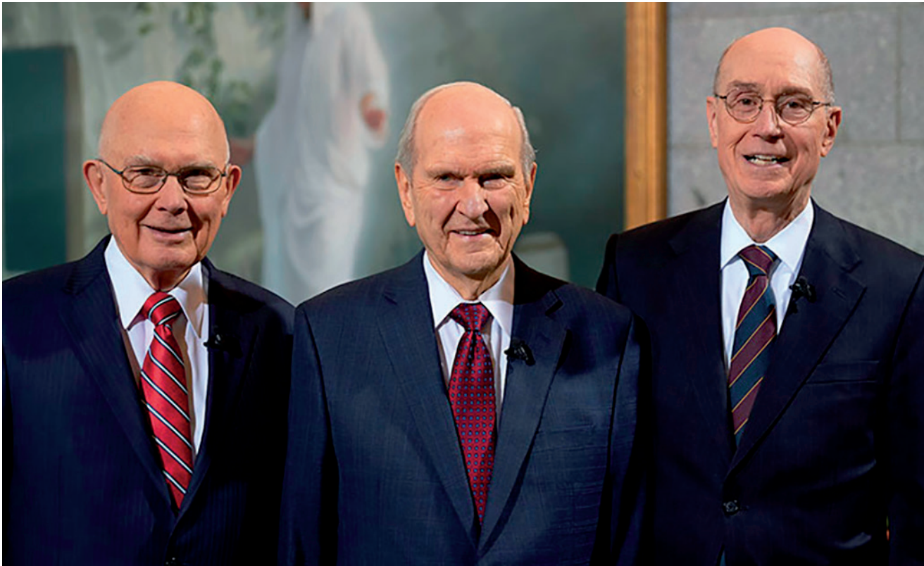
Above: President Russell M. Nelson with his two counselors, Dallin H. Oaks and Henry B. Eyring.