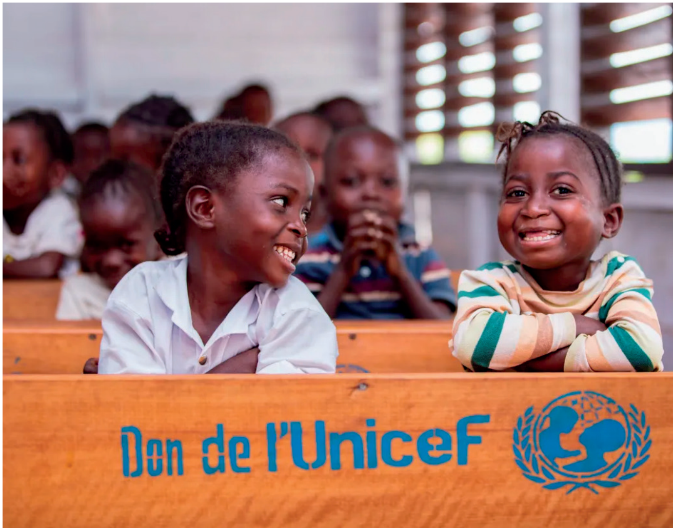
Above: Two young children in South Sudan happily attend their new school.

This year, the donations of Church members and friends to Light the World provided meals, clothing for children, polio vaccines, chickens to help struggling families, feminine hygiene kits, and more. People from around the world contributed, with total donations exceeding millions.