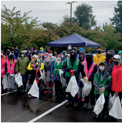
Above: At an interfaith trash pickup day in Portland, Oregon, volunteers came together to collect between 500 and 600 pounds of trash.

“In times of ever greater polarization ... being curious about and understanding our neighbours’ faith perspectives or spirituality allows us to become better neighbours.”