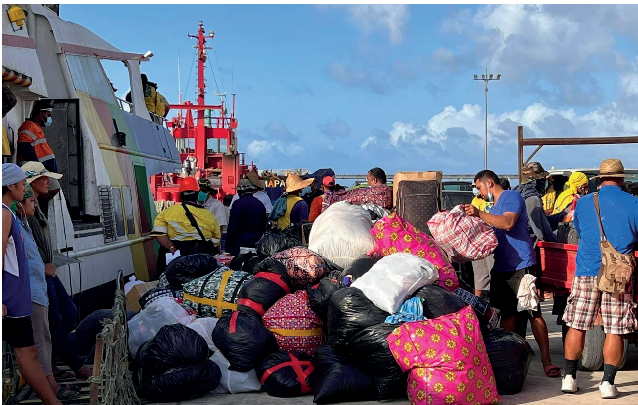
Above: Congregations in the area gathered and donated needed items to help the people of Tonga.

“The humanitarian work of the Church is such a gift. It is the product of the collective, consecrated offerings of the Saints, a manifestation of our love for God and His children.”