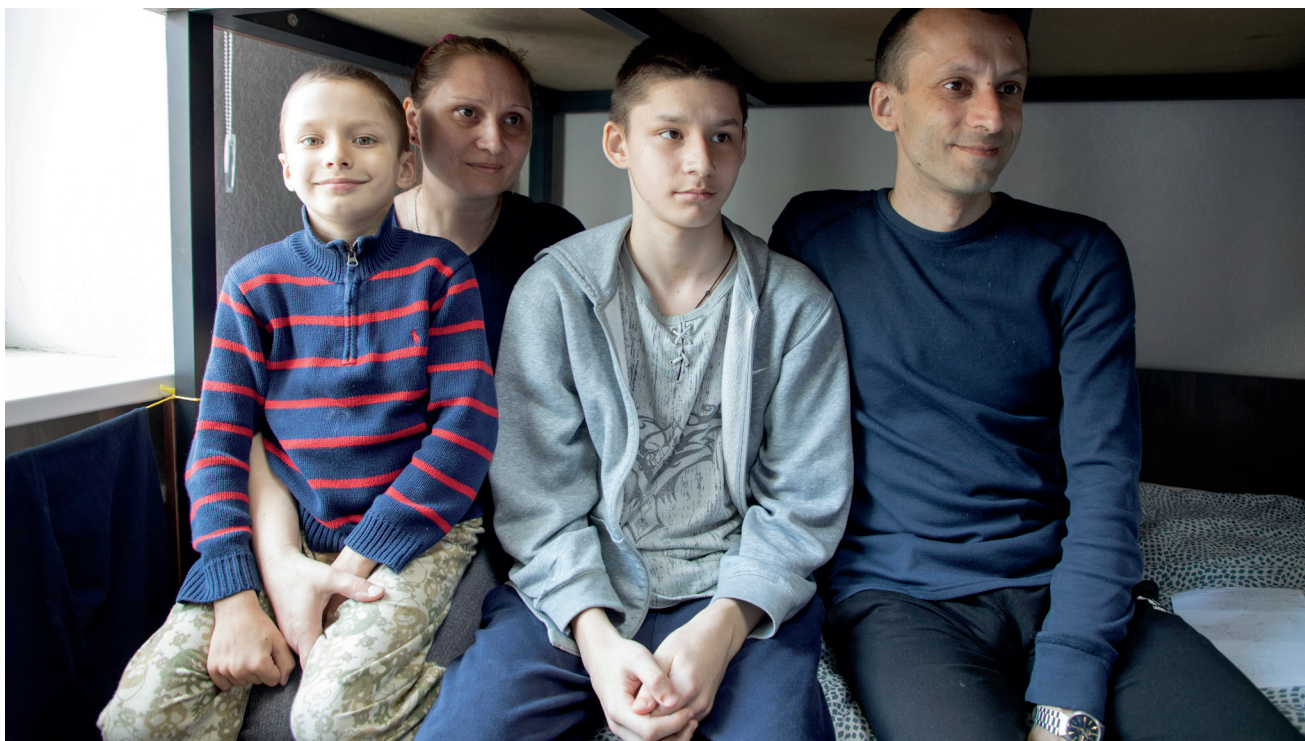
Above: A Ukrainian family that has found shelter in another European country.

“The Church of Jesus Christ of Latter-day Saints is one of USA for UNHCR’s most trusted and long-standing partners. Together we continue to restore hope, safety, and dignity to the over 100 million individuals forcibly displaced from their homes due to persecution, conflict, or violence.”