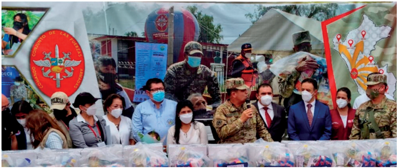
Above: A group of officials gather donations to the General Hospital of the Barrio Obrero in Asunción, Paraguay.