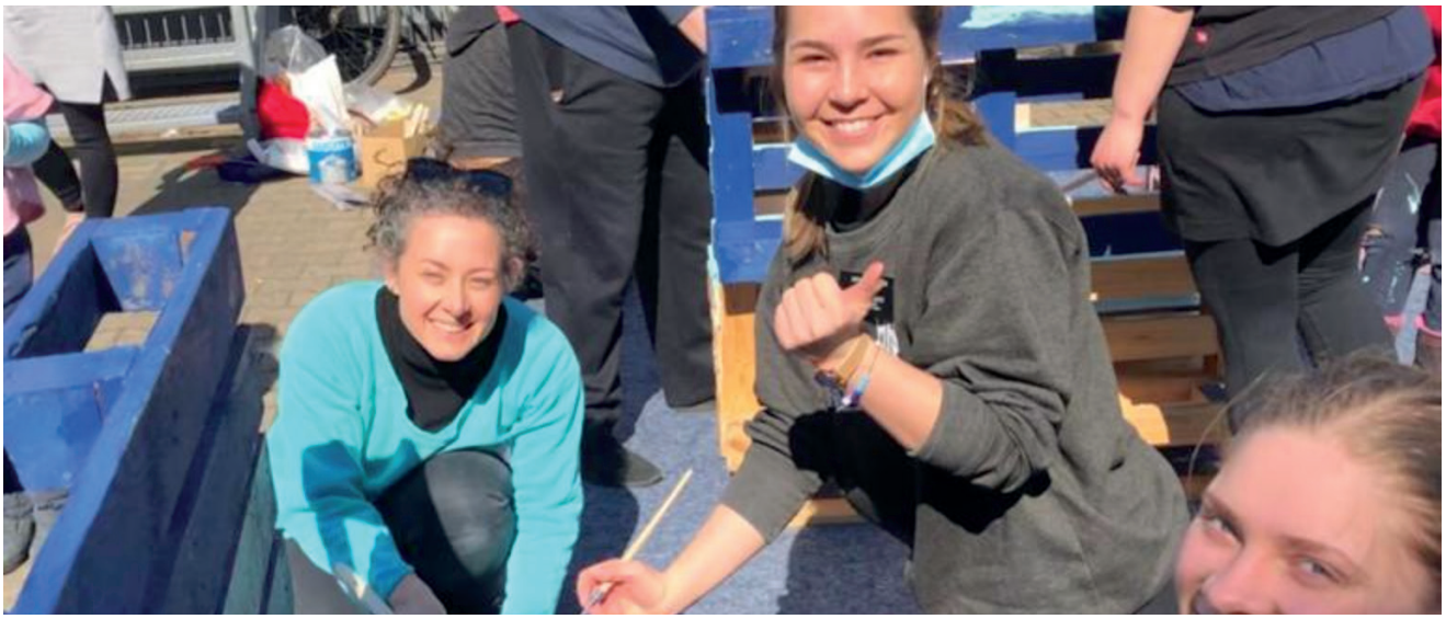
Above: A group of service missionaries paint furniture at Caritas homeless refugee center in Friedrichsdorf, Germany.