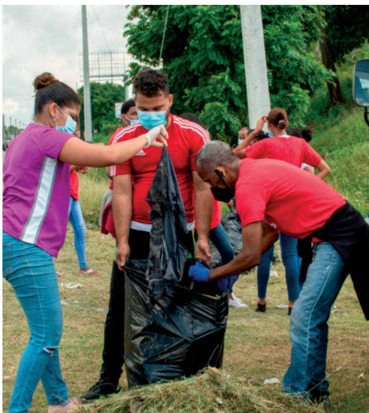
Photo at top: Locals in the Caribbean support each other following the impact of Hurricane Fiona.