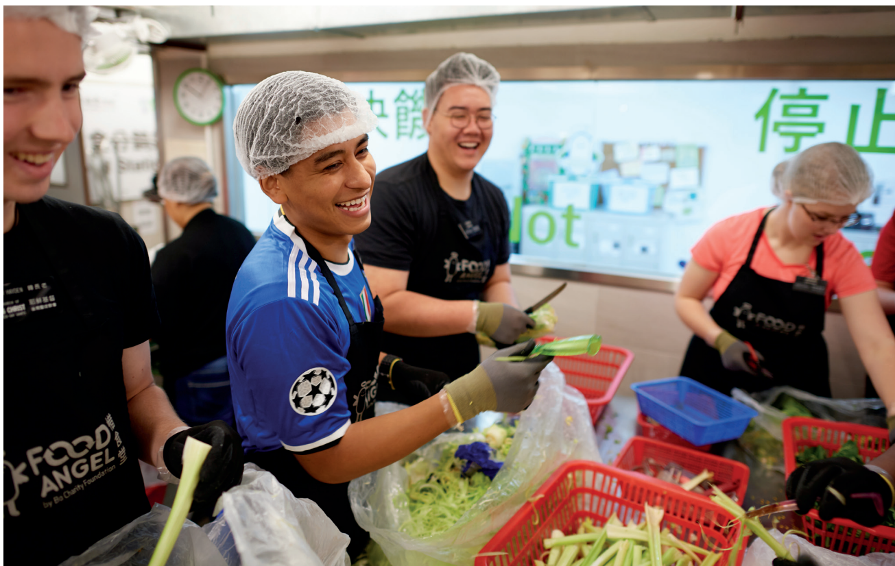
Above: Missionaries help prepare food during a service project in Hong Kong.

“Now is the time we can bless others and ‘lift up the hands which hang down.’”