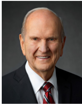
Russell M. Nelson Peresitene