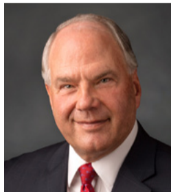
Ronald A. Rasband