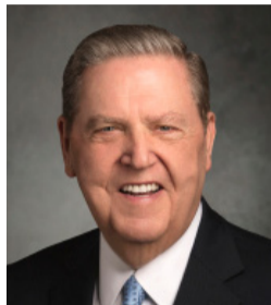
Jeffrey R. Holland