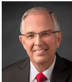
Neil L. Andersen