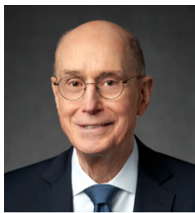
Henry B. Eyring Fesoasoani Lua