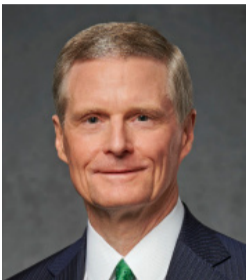
David A. Bednar