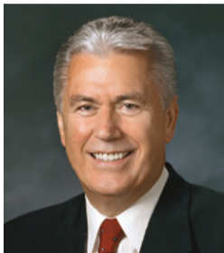
Dieter F. Uchtdorf