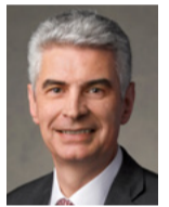
Gérald Caussé Epikopo Pulefaamalumalu