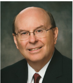
Quentin L. Cook