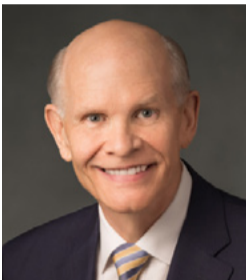
Dale G. Renlund