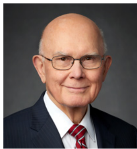
Dallin H. Oaks Fesoasoani Muamua