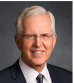
D. Todd Christofferson