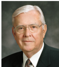
M. Russell Ballard