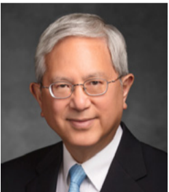
Gerrit W. Gong