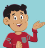
ILLUSTRATION BY COREY EGERT

Write and tell us what your family likes to do on Sundays! Turn to the back cover to see how.