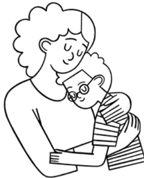
I do my best to make good choices and keep God's commandments.

Atonement of Jesus Christ: The sacrifice Jesus Christ made when He suffered and died for us and then rose again. Because of His Atonement, we will live again after we die, and we can also repent.