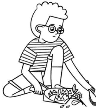
I say "I'm sorry" and do what I can to fix what I did.