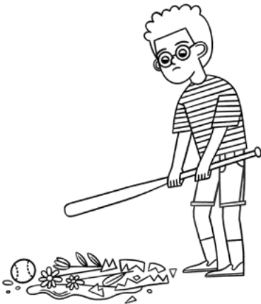
I recognize that I made a wrong choice.