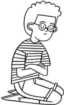
I ask Heavenly Father for forgiveness.