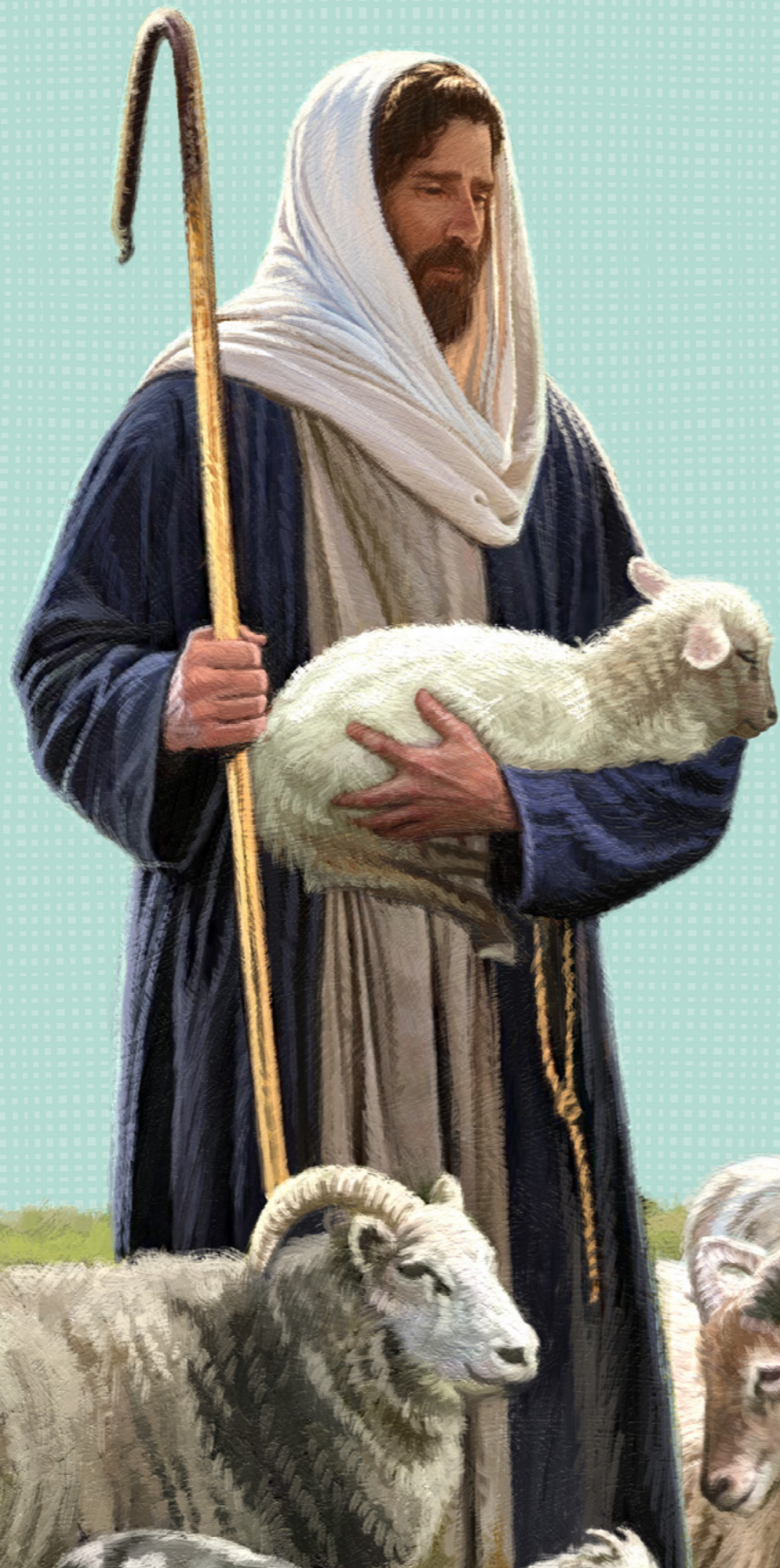
ANSWERS: JESUS CHRIST, THE HOLY GHOST; HIS NAME (CHRIST)

Jesus Christ is called the Good Shepherd. We are like His sheep. He watches over us and guides us. In the New Testament, Jesus taught that He had "other sheep" who lived in another part of the world (John 10:16). After He was resurrected, He visited some of those other people in the Americas. He blessed them. He healed them and taught them. He loved them just like He loved the people in Jerusalem. Jesus has other sheep all over the world. He loves all of Heavenly Father's children no matter where they live. He loves you! ●