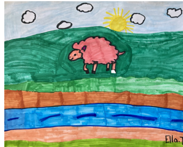
Ella T., age 9, Texas, USA