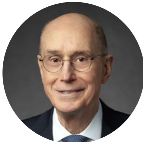
By President Henry B. Eyring Second Counselor in the First Presidency