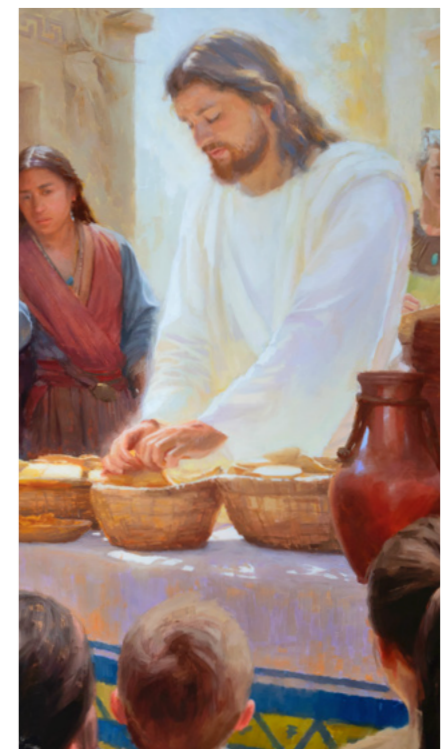
ILLUSTRATION BY ALYSSA PETERSEN. PAINTINGS OF CHRIST BY CASEY CHILDS