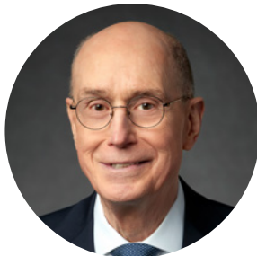
By President Henry B. Eyring Second Counselor in the First Presidency