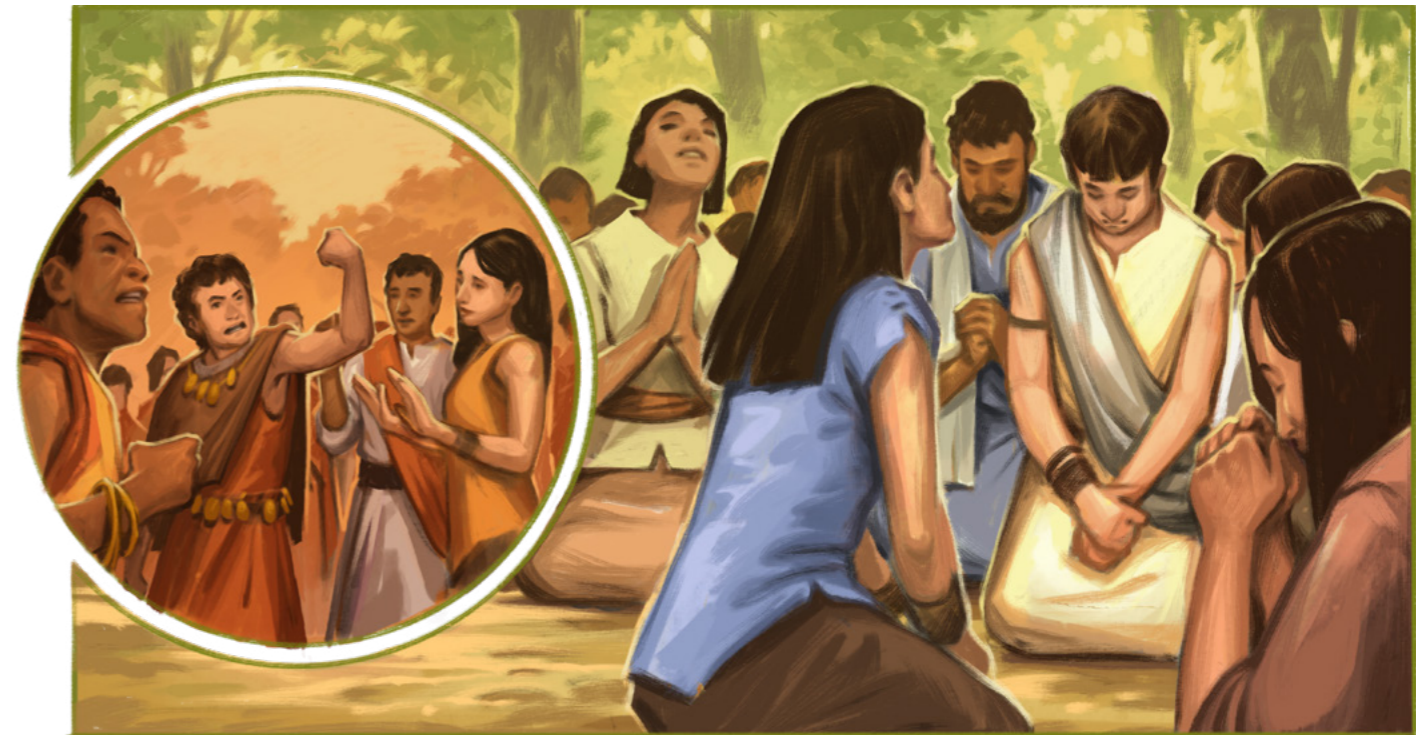
Nifae i askem ol pipol blong sakem sin. Sam long olgeta oli no laekem wanem Nifae i tijim. !Be plante narafala oli lisin! Ol pipol oli stat blong sakem sin mo jenisim fasin blong olgeta. ●