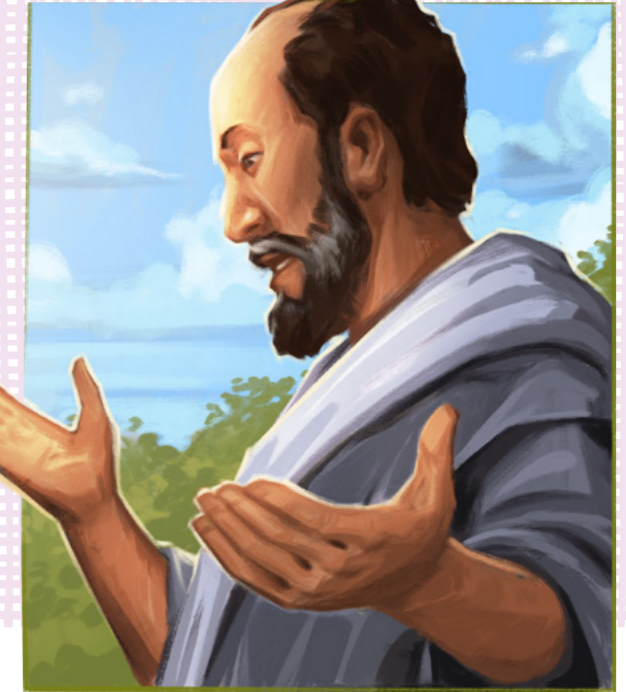
Sam pipol oli luk save Nifae long taoo. Oli stop blong lisin mo karem tugeta ol narafalawan blong lisin. Taem Nifae i finis blong prea, hem i luksave se oli stap lukluk mo hem i stat blong tijim olgeta.