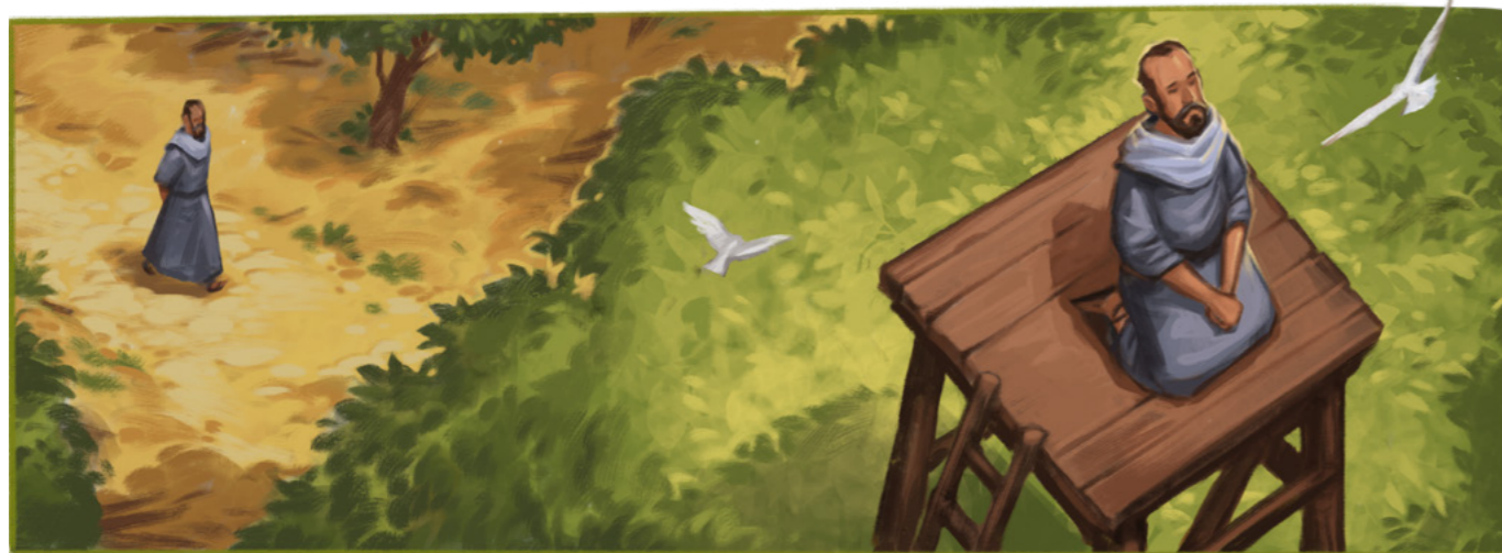
Nifae i go long garen blong hem. Hem i klaem long taoo long garen mo prea long God long ples ia. Hem i prea from ol pipol.